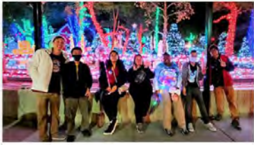
December 4, 2021 @ Opportunity Village – Magical Forest