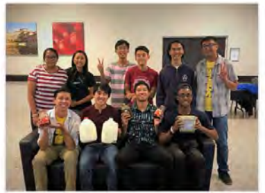
May 4, 2019 @ Club Christ Ladies Tea