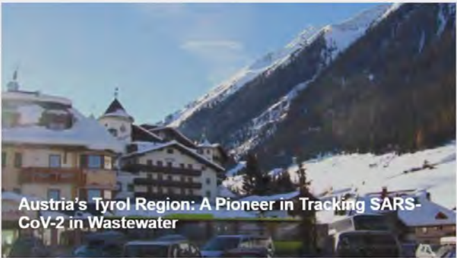
Austria’s Tyrol Region: A Pioneer in Tracking SARS- CoV-2 in Wastewater