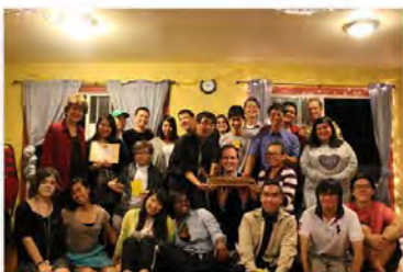
Shine City Project's 2nd Anniversary Celebration (March 14, 2015)