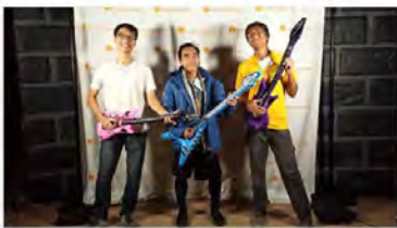
October 30, 2015 @ Haunted Harvest, Springs Preserve