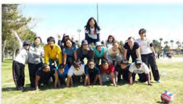
Shine City Project's 1st Anniversary (March 15, 2014 @ Sunset Park)