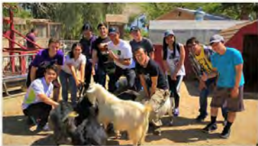
April 20, 2019 @ Gilcrease Nature Sanctuary