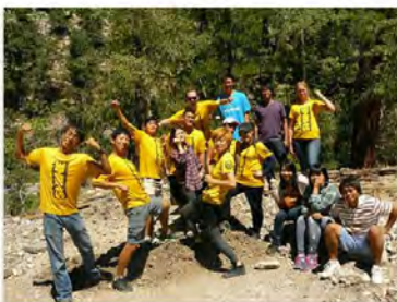
August 15, 2014 @ Mt. Charleston