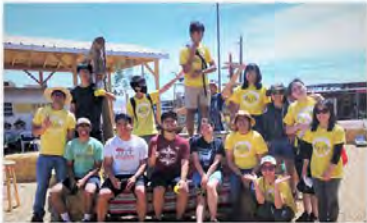
May 7, 2022 @ McKee Ranch Foundation