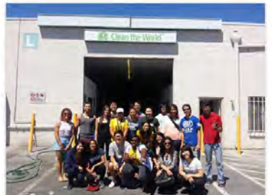
July 25, 2015 @ Clean the World