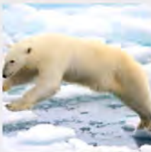
Canada’s Shrinking Polar Bear Population