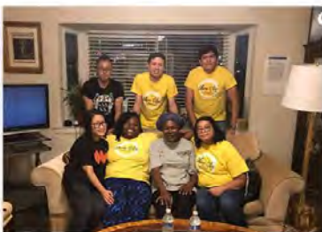
July 24, 2021 @ Harrison House