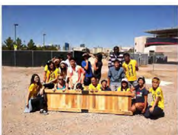
October 13, 2018 @ Las Vegas Wash with Generation Peace Academy