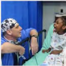
“Take Two Capsules, Twice Daily—Maybe”