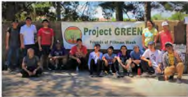
April 27, 2019 @ Pittman Wash