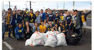
April 25, 2014 @ El Pollo Loco