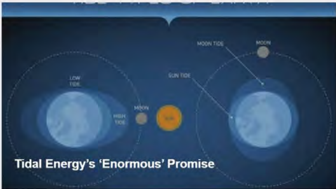
Tidal Energy’s ‘Enormous’ Promise