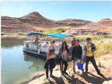
October 20, 2018 @ 33 Hole Overlook, Lake Mead