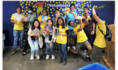
June 11, 2022 @ Spread the Word Nevada