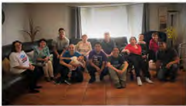
June 8, 2019 @ Silver Horizon Group Home