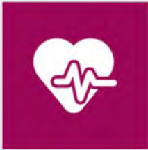
Study Ties Environmental Factors to Cardiovascular Health Risks