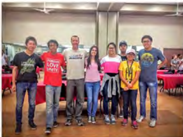
July 31, 2015 @ Las Vegas Rescue Mission