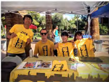
September 2, 2015 @ UNLV Involvement Fair