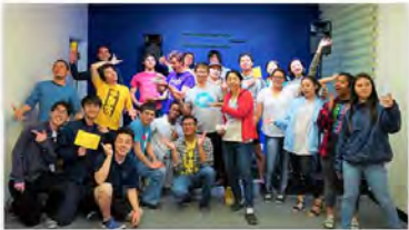
Shine City Project's 6th Anniversary Celebration (March 16, 2019 @ CARP Las Vegas Learning Center)