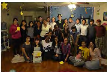
Shine City Project's 3rd Anniversary Celebration (March 18, 2016)