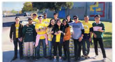
November 9, 2019 @ Just One Project – Helen Marie Smith Elementary School