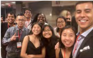
October 2, 2021 @ Shaquille O'Neal Foundation – The Event