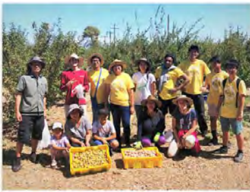
August 6, 2022 @ Ahern Orchard