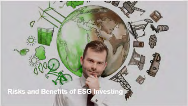
Risks and Benefits of ESG Investing