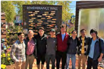
March 9, 2019 @ Las Vegas Community Healing Garden