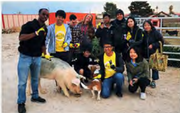
January 12, 2020 @ All Friends Animal Sanctuary