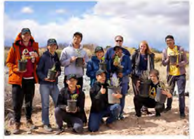
March 2, 2019 @ Las Vegas Wash