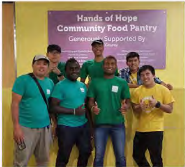
August 17, 2019 @ Catholic Charities of Southern Nevada with International Leadership Training Program (ILTP)