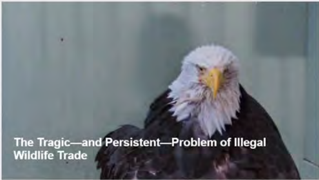
The Tragic—and Persistent—Problem of Illegal Wildlife Trade