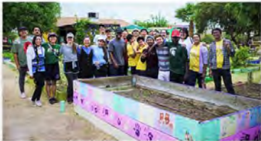
May 29, 2021 @ Vegas Roots Community Garden