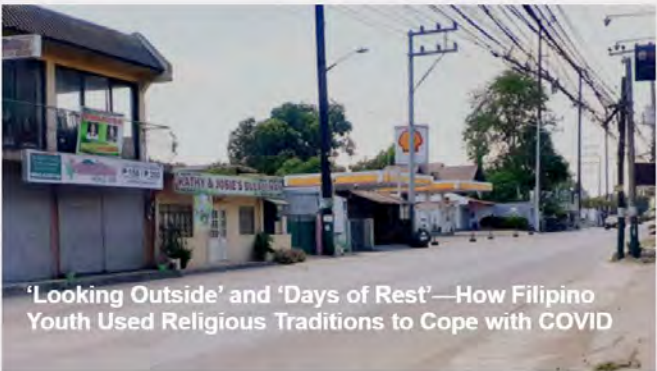
‘Looking Outside’ and ‘Days of Rest’—How Filipino Youth Used Religious Traditions to Cope with COVID

Sign up for our bi-monthly environmental publication and get notified when new issues of The Earth & I come out!