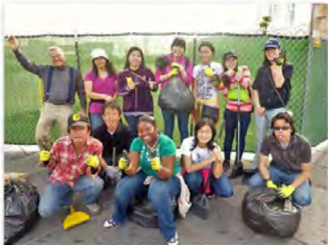
Our First Service Project (March 16, 2013 @ World's Largest Gift Shop)