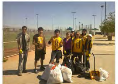
April 26, 2013 @ Lorenzi Park