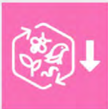
Causes of Biodiversity Loss