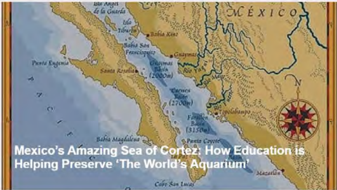
Mexico’s Amazing Sea of Cortez: How Education is Helping Preserve ‘The World’s Aquarium’