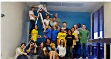
August 16, 2014 @ CARP Las Vegas Learning Center