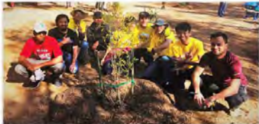
November 23, 2019 @ Green Our Planet – Legacy High School