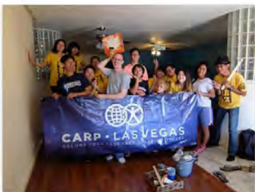
August 22, 2014 @ CARP Las Vegas House