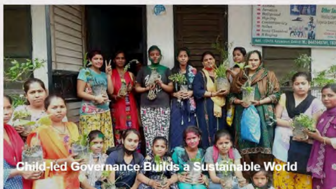
Child-led Governance Builds a Sustainable World