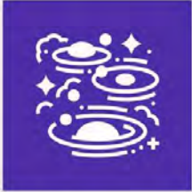
Our Supreme Solar Community