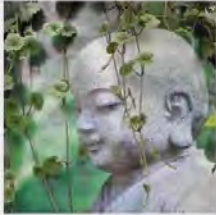
C.R.E.A.T.I.O.N: Faith and the Environment