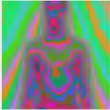
Environmental Scientists Share Cutting-Edge Research