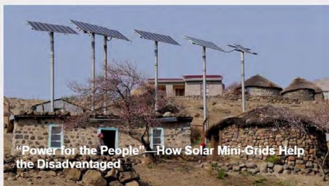
"Power for the People" — How Solar Mini-Grids Help the Disadvantaged