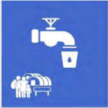
Refugee Camps and Clean Water