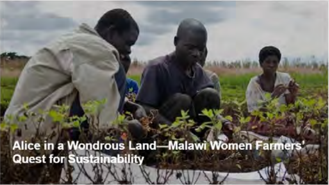
Alice in a Wondrous Land—Malawi Women Farmers' Quest for Sustainability