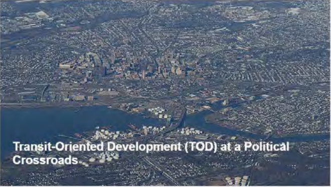
Transit-Oriented Development (TOD) at a Political Crossroads

Sign up for our bi-monthly environmental publication and get notified when new issues of The Earth & I come out!