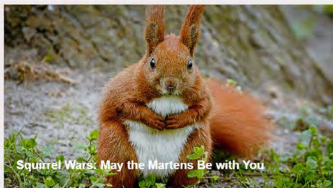
Squirrel Wars: May the Martens Be with You