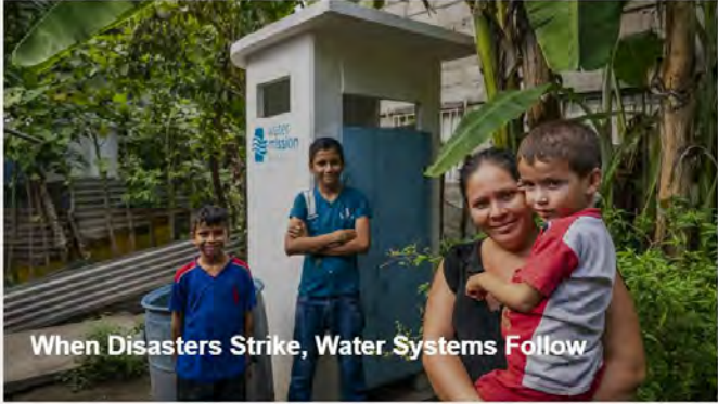
When Disasters Strike, Water Systems Follow