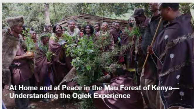
At Home and at Peace in the Mau Forest of Kenya—Understanding the Ogiek Experience