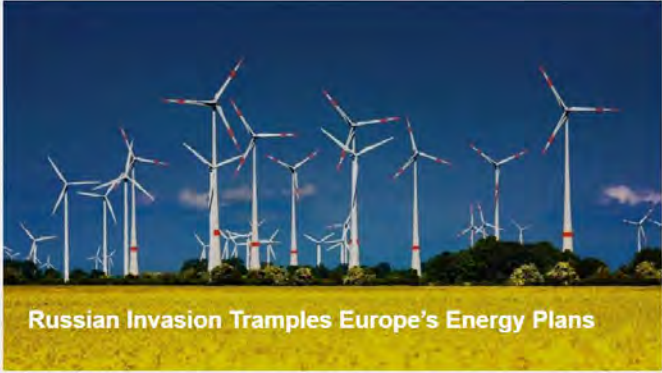
Russian Invasion Tramples Europe's Energy Plans