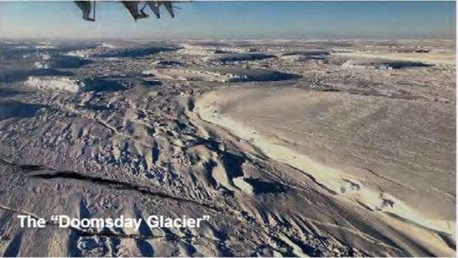
The "Doomsday Glacier"