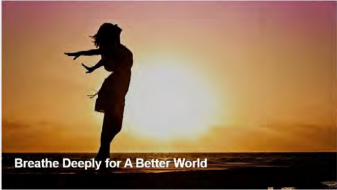
Breathe Deeply for A Better World