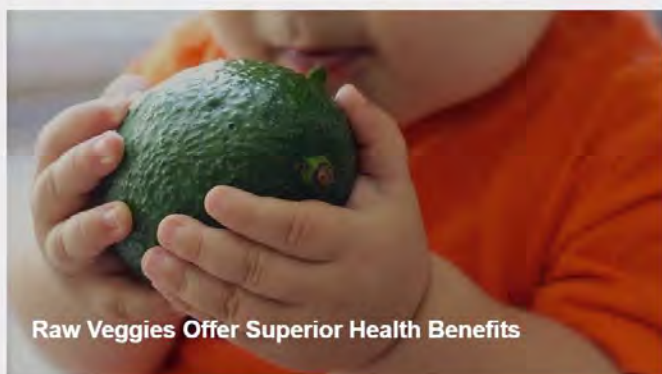
Raw Veggies Offer Superior Health Benefits