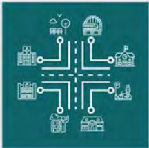
What Transit-Oriented Development Can Do for You