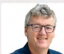
International Science Conference Ushers in Earth Day