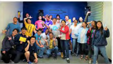
Shine City Project's 6th Anniversary Celebration (March 16, 2019 @ CARP Las Vegas Learning Center)