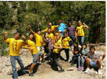
August 15, 2014 @ Mt. Charleston