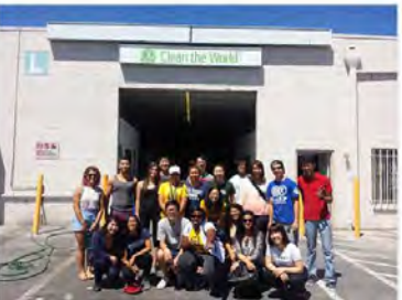
July 25, 2015 @ Clean the World