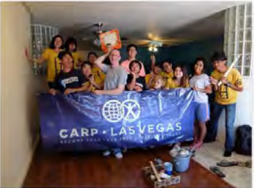
August 22, 2014 @ CARP Las Vegas House