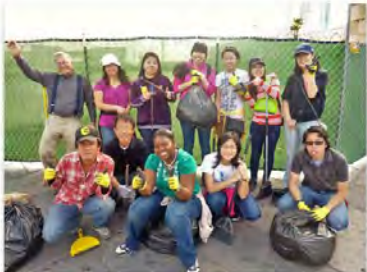
Our First Service Project (March 16, 2013 @ World's Largest Gift Shop)