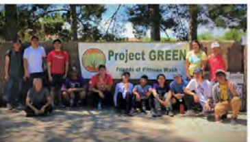
April 27, 2019 @ Pittman Wash