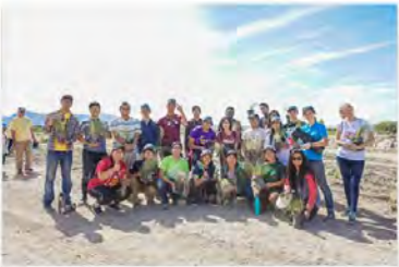
October 13, 2018 @ Las Vegas Wash with Generation Peace Academy