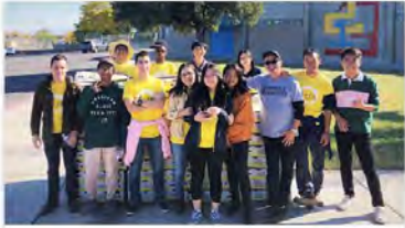
November 9, 2019 @ Just One Project – Helen Marie Smith Elementary School