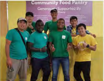
August 17, 2019 @ Catholic Charities of Southern Nevada with International Leadership Training Program (ILTP)