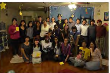
Shine City Project's 3rd Anniversary Celebration (March 18, 2016)