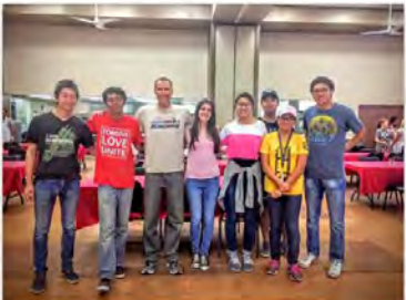
July 31, 2015 @ Las Vegas Rescue Mission