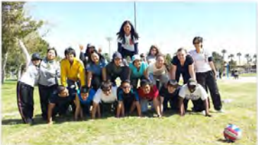
Shine City Project's 1st Anniversary (March 15, 2014 @ Sunset Park)