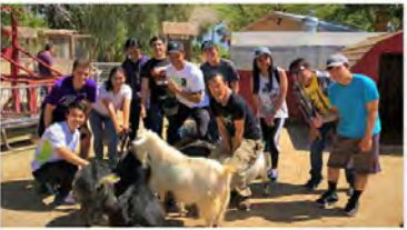
April 20, 2019 @ Gilcrease Nature Sanctuary