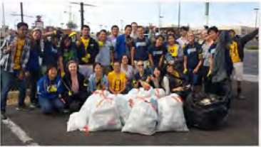
April 25, 2014 @ El Pollo Loco