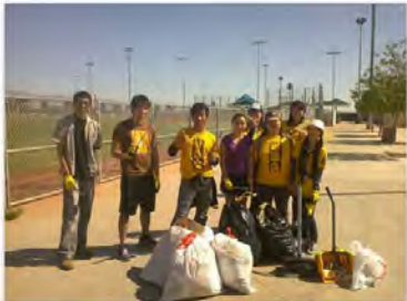
April 26, 2013 @ Lorenzi Park