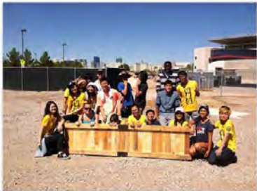
August 9, 2014 @ Rebel Recycling Center