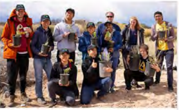
March 2, 2019 @ Las Vegas Wash