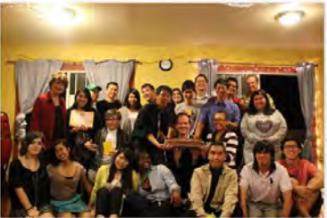
Shine City Project's 2nd Anniversary Celebration (March 14, 2015)