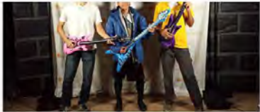
October 30, 2015 @ Haunted Harvest, Springs Preserve