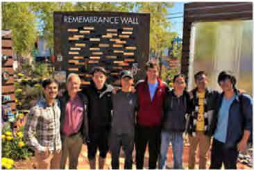
March 9, 2019 @ Las Vegas Community Healing Garden