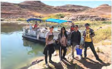
October 20, 2018 @ 33 Hole Overlook, Lake Mead