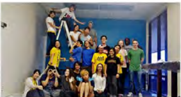
August 16, 2014 @ CARP Las Vegas Learning Center