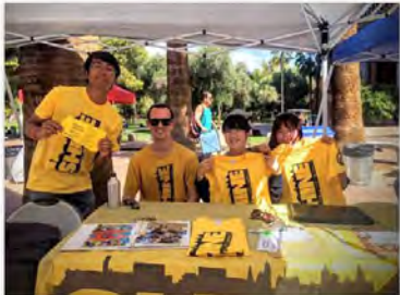
September 2, 2015 @ UNLV Involvement Fair