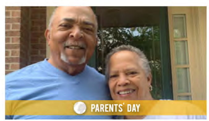
July 26, 2021

On this day, Americans recognize outstanding parents and support this role of parents raising children and building a strong and stable society. Happy Parents' Day... Read more