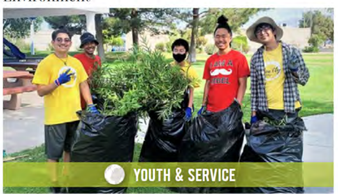
July 28, 2021

From coast to coast, it's been a busy summer for the International Association of Youth and Students for Peace (IAYSP) USA, a Unificationist youth service... Read more