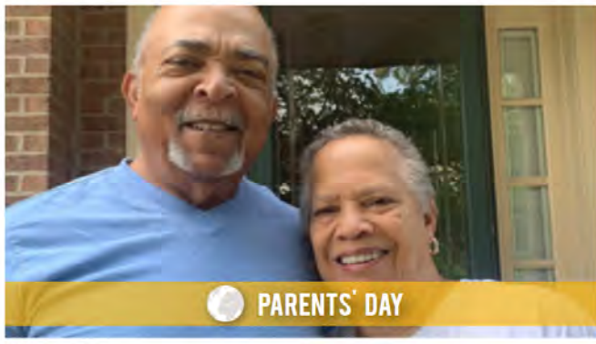
July 26, 2021

On this day, Americans recognize outstanding parents and support this role of parents raising children and building a strong and stable society. Happy Parents' Day... Read more