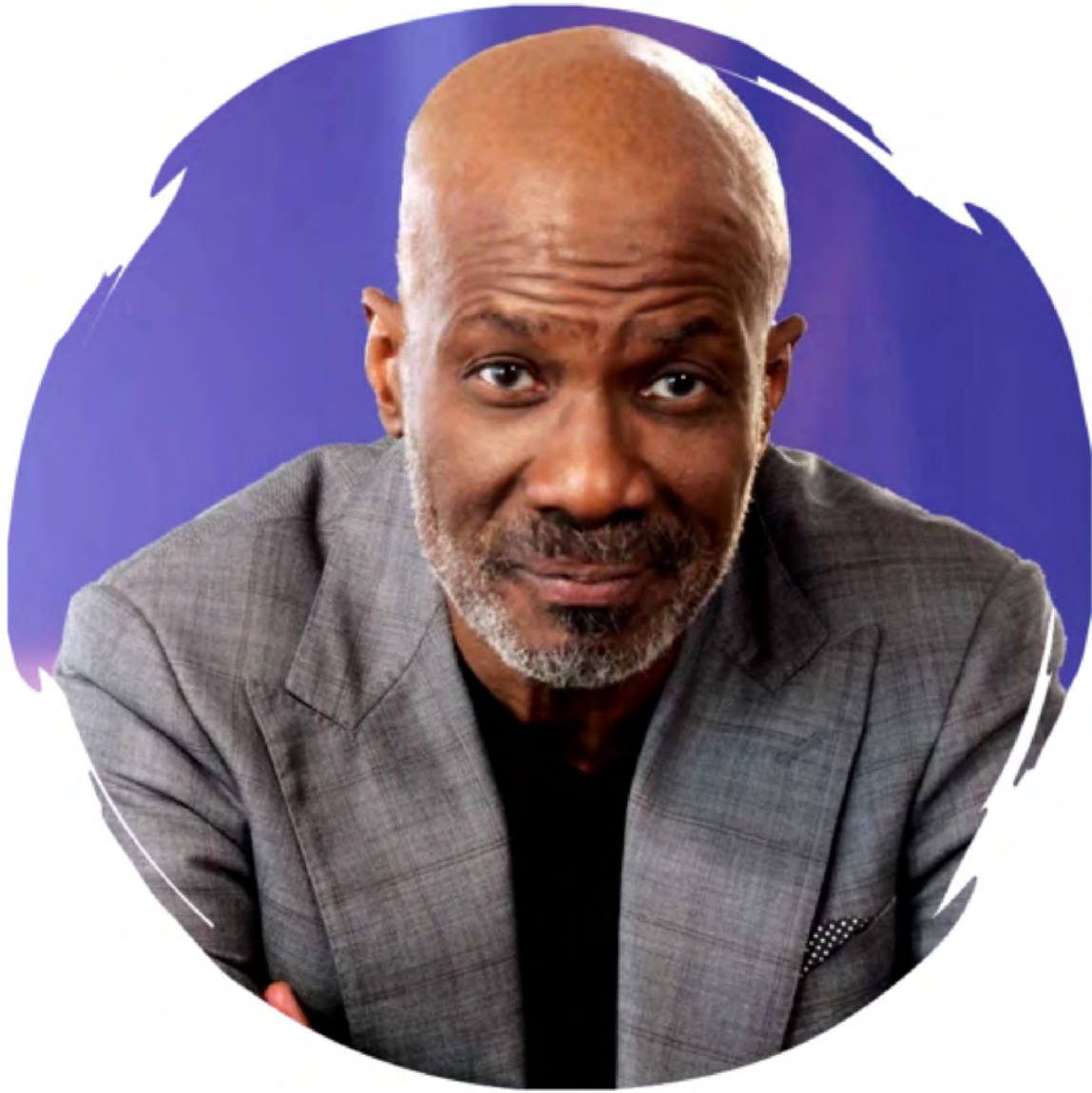
Bishop Noel Jones