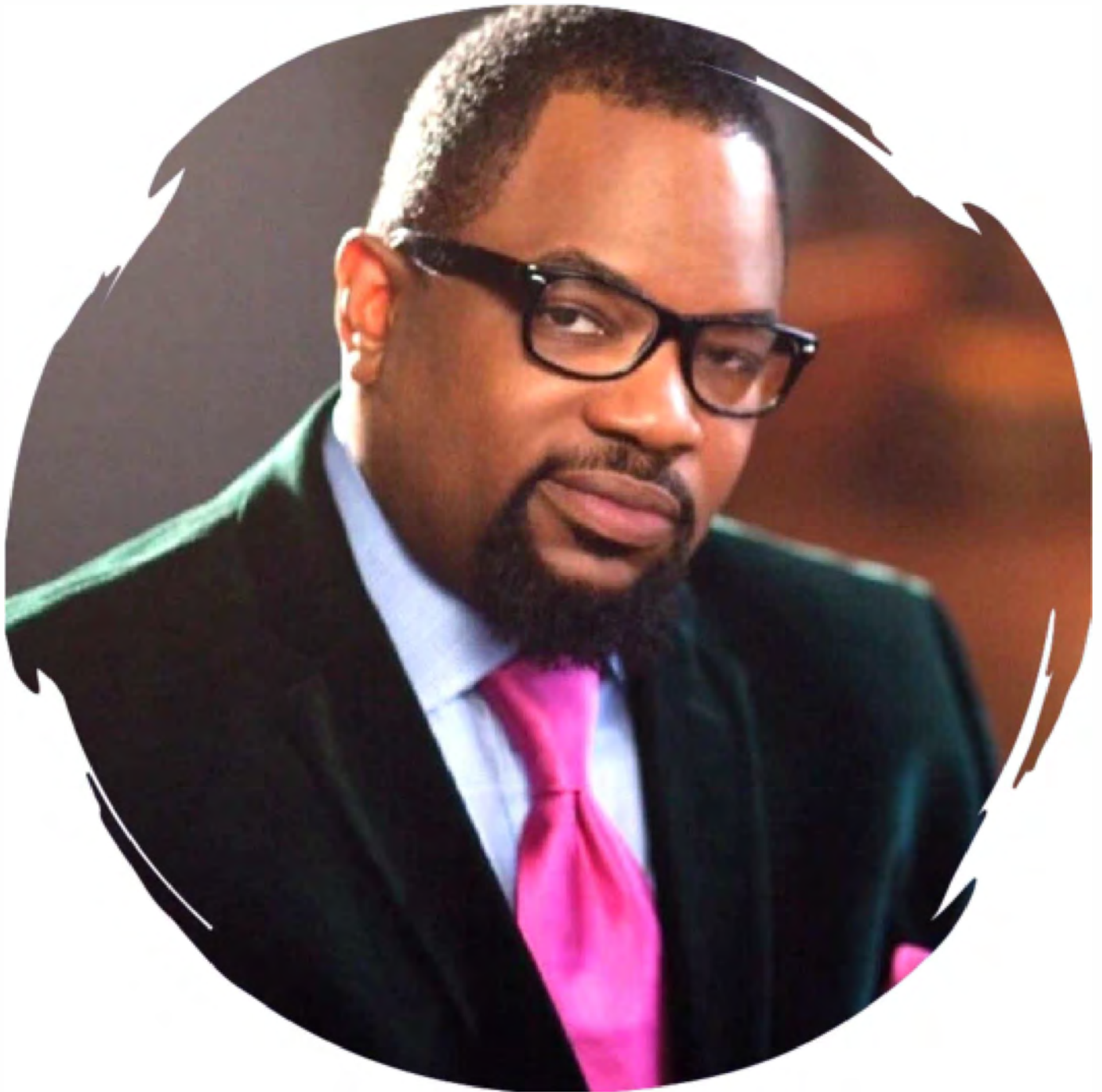
Bishop Hezekiah Walker