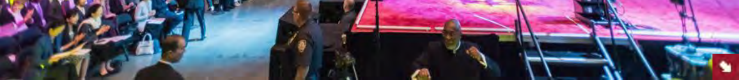
Hezekiah Walker, gospel composer and choral grandmaster leads the choir for an appreciative audience. more >

By Special Sections Department - Thursday, August 23, 2018