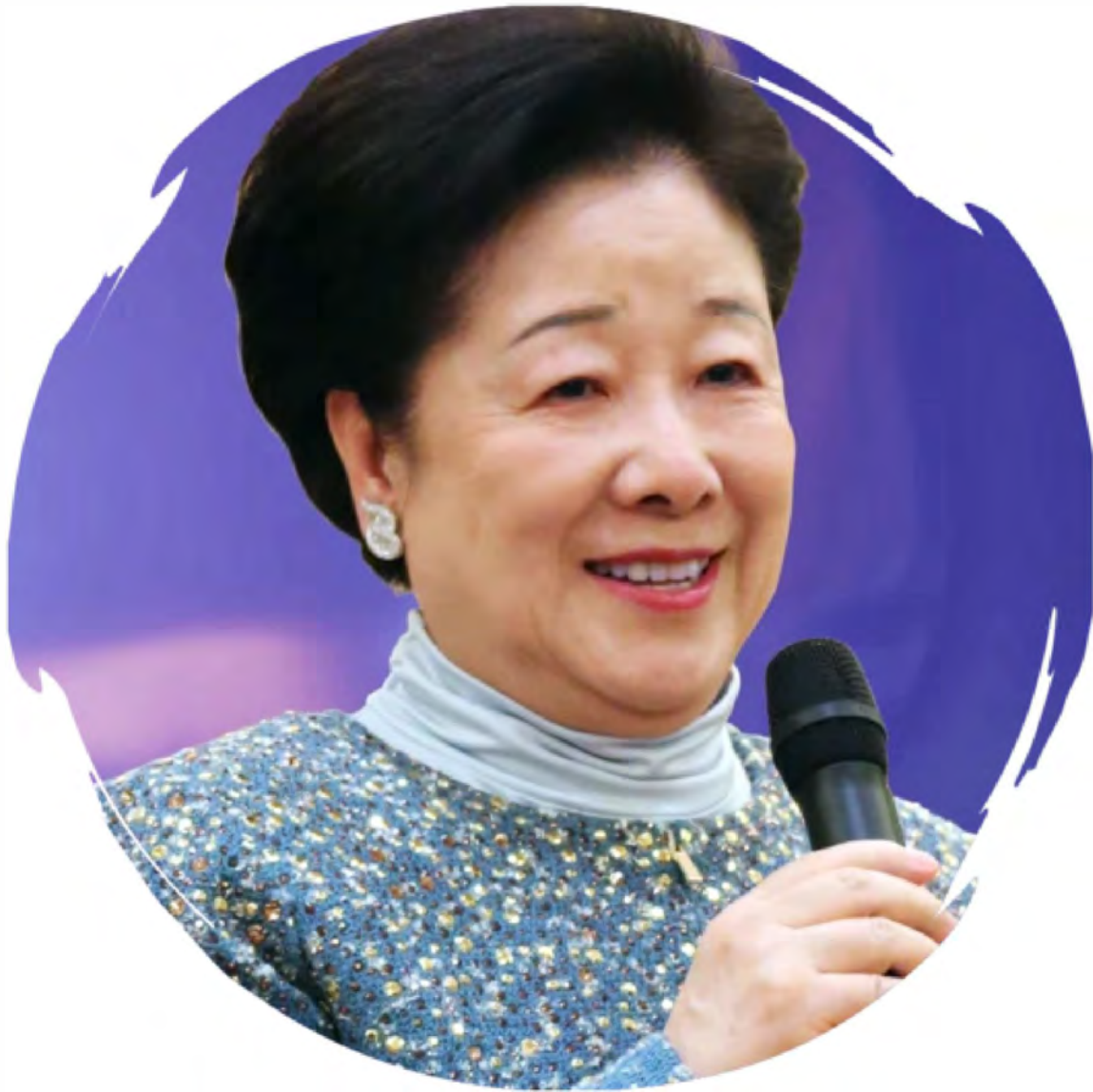
Dr. Hak Ja Han Moon