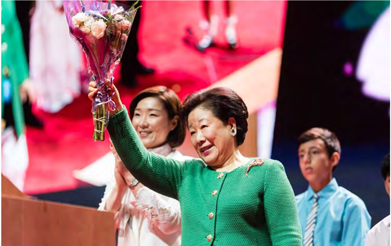
Dr. Hak Ja Han Moon at first Peace Starts With Me (Madison Square Garden)

In just four short years, the rapidly growing international Peace Starts With Me movement launched by Dr. Hak Ja Han Moon on July 15, 2017 has touched millions of lives across the globe. From the jam-packed venues of Madison Square Garden, Nassau Coliseum, MGM Grand Hotel, and Prudential Center, to virtual rallies held in 2020 and 2021, people of all backgrounds have joined Dr. Moon's call for a world of peace beginning with each one of us.