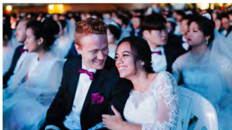
Are Mass Weddings For You?