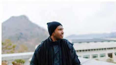
What Is Your God Language?