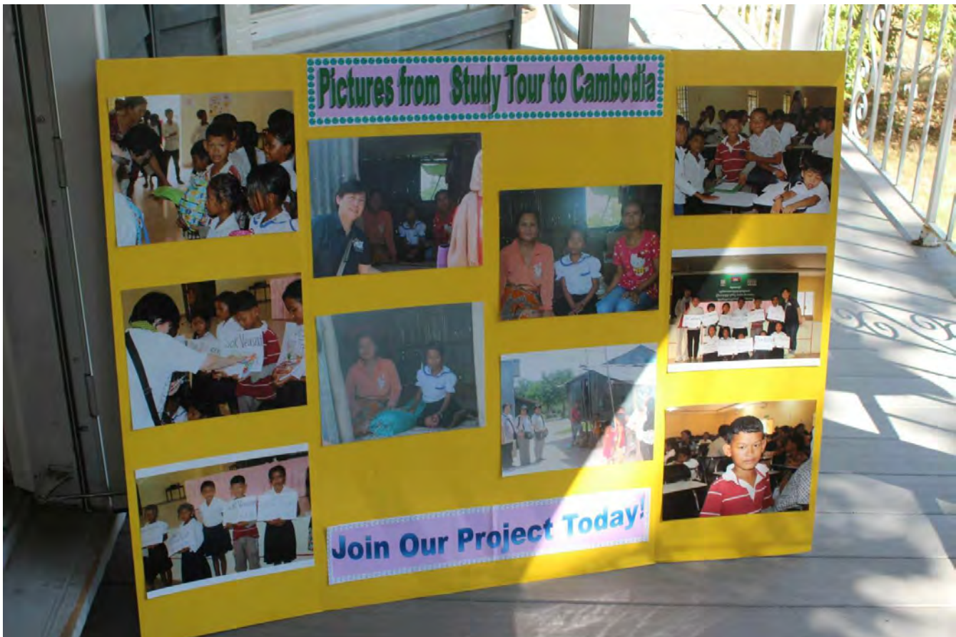
Display Poster for the Cambodia Project