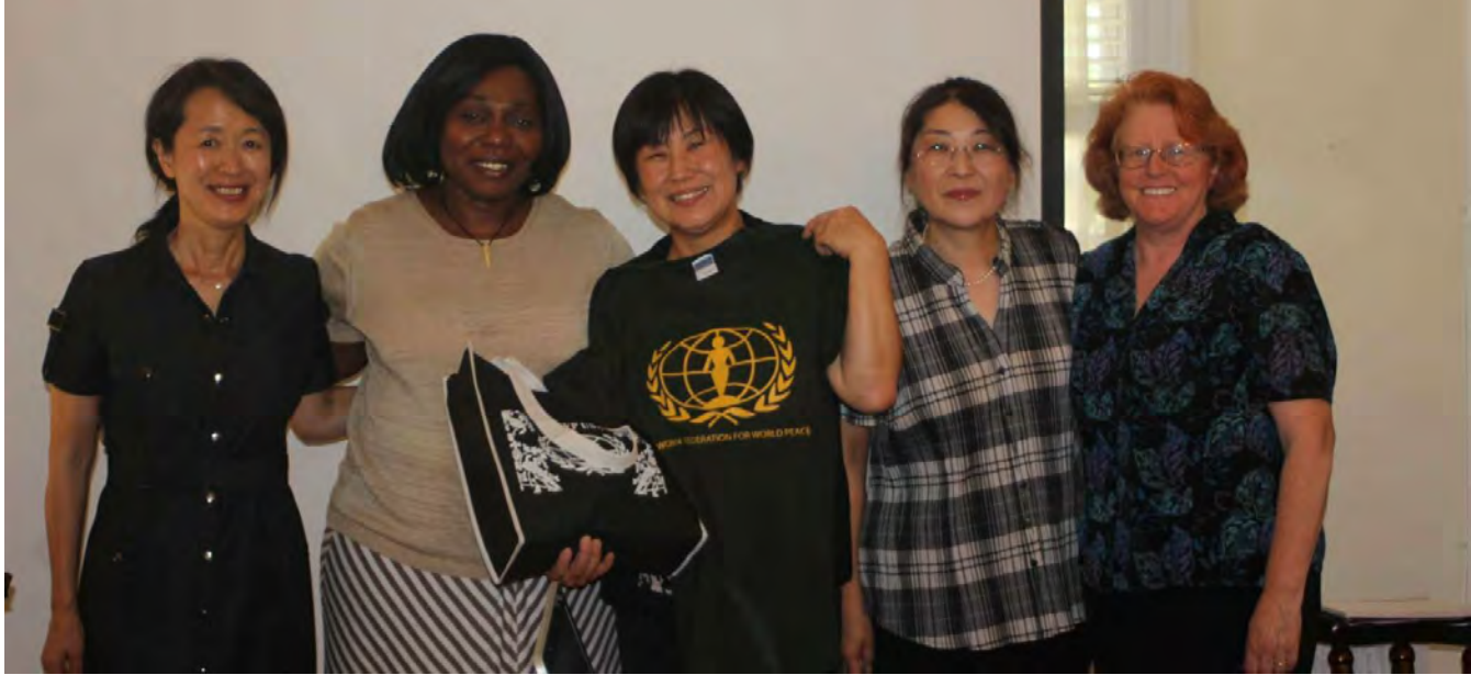
The New Jersey Leadership Team