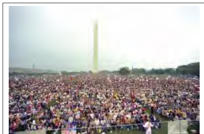
An overview of the Washington Monument rally on September 18, 1976.

According to Rev. Moon, the Third Great Awakening was based on a new ideological, religious worldview. At that time, America was in turmoil, and Father Moon worked to reverse that decline. He sought to bring about an awakening based on a revival of the spirit of the founding fathers. President Ronald Reagan described America as a “city on the hill” for everyone to see. On the foundation of that revival, a change occurred which created an upswing in the 1980s and beyond.