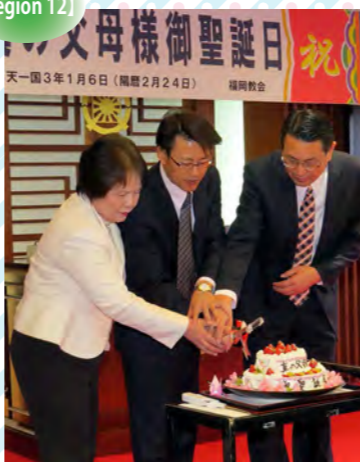
Cake cutting at the special gathering in Fukuoka Church (Feb. 24th)