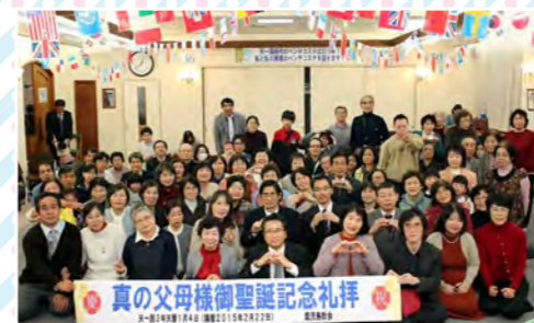
Members gathered at a commemorative service in Kagoshima Church (Feb. 22nd)