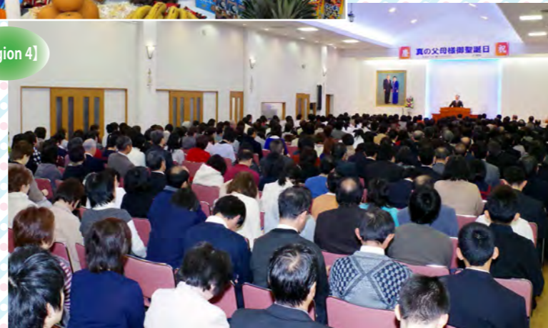
More than 500 people gathered at the commemorative service at Nagoya Church (Feb. 22nd)