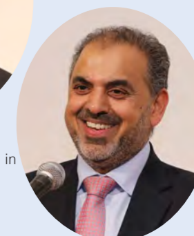
Lord Ahmed speaking in Fukuoka (Feb. 15)