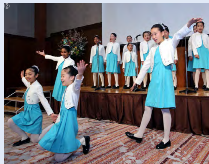
① Japan-Europe Special Forum held in Fukuoka ② Children of Fukuoka Sunhak Chorus give a charming performance ③ Lord Ahmed visits Dazaifu Tenman-gu Shrine in Fukuoka

In Fukuoka, the Japan-Europe Special Forum was jointly organized by the Fukuoka Prefectural Council of Ambassadors for Peace, UPF-Japan etc. in the morning of February 15th. About 500 participants including its prefectural assembly members, academics and a Buddhist temple master attended.