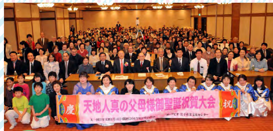
About 300 people gathered at a festival held in Iwate (Feb. 22nd)