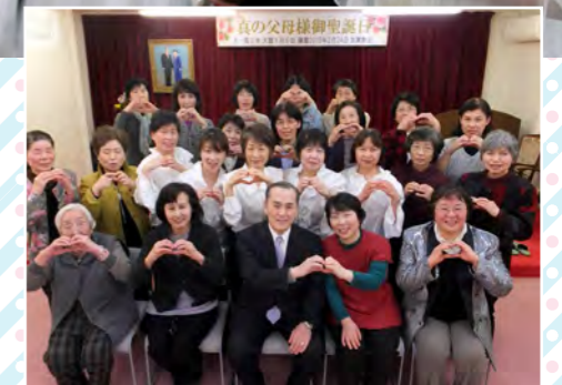
Members gathered at a commemorative event held in Kaga Church of the Ishikawa parish (Feb. 24th)