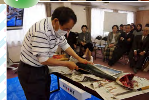
There was a winter yellowtail disassembling performance at the celebratory event in Heijo Church in Nara (Feb. 22nd)