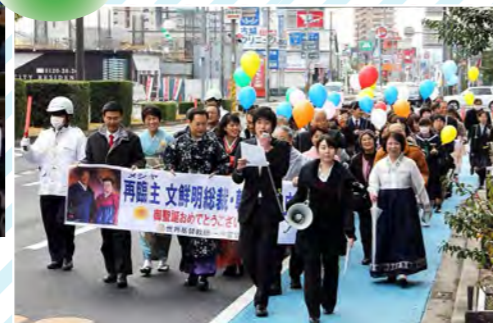
Members of the East Hiroshima parish marched through Fukuyama city and testified about True Parents (Feb. 22nd)