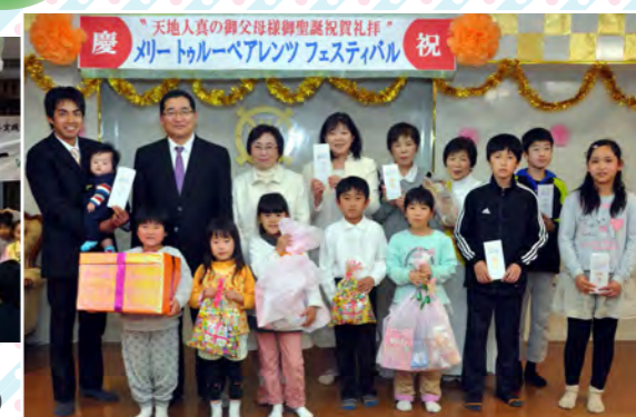
Prize winners of the Happy Family Contest hosted by Funabashi Central Church in competitions of drawings, essays etc. (Feb. 22nd)