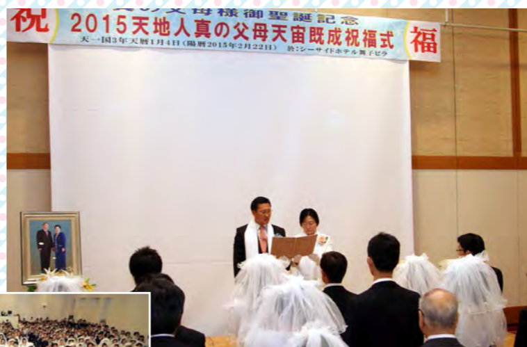
The Okayama parish held a Blessing Ceremony with 60 new couples starting as Blessed Families (Feb. 22nd)