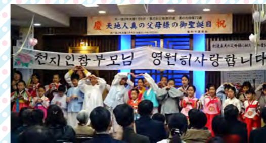
Primary school children sang in chorus at a commemorative ceremony in Chiba Church (Feb. 22nd)