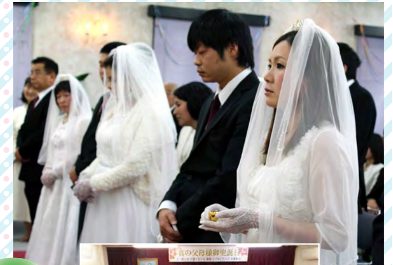
Gifu parish conducted Blessing Ceremony (Feb. 22nd)