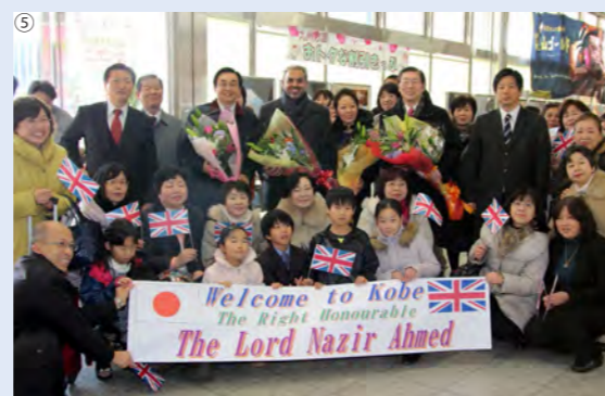
① Participants of Japan-Europe Special Seminar in Kobe ② Lord Ahmed speaks at Japan-Europe Special Seminar in Kobe (Feb. 14) ③ Lord Ahmed shakes hand with people at Kobe Mosque ④ Lord Ahmed visits Kobe Mosque ⑤ Local members welcome Lord Ahmed at Kobe Station

Arriving in Tokyo in the evening of February 13th, Lord Ahmed moved to Kobe City the following morning. In Kobe, he first visited the Kobe Mosque and offered prayer together with the local Muslims. The Kobe Mosque is the oldest mosque in Japan built in 1935. It survived the Great Hanshin Awaji Earthquake in January 1995, serving as an evacuation center for local residents.