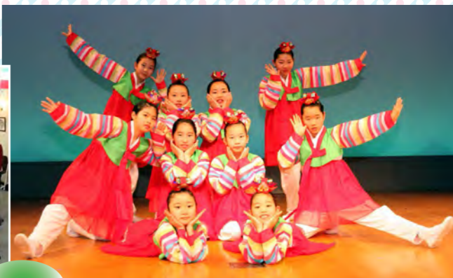
Primary school children performed a Korean play and dance at a festival held in Kumamoto parish (Feb. 22nd)