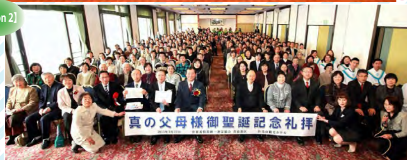
A commemorative service was held in a hotel in Aomori city. (Feb. 22nd)