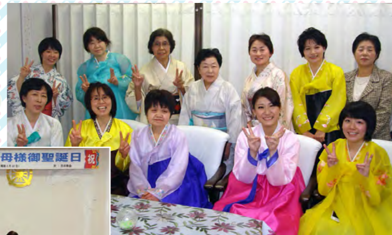
At a Japan-Korea exchange event hosted by Kanayama Church of the South Aichi parish (February 22nd)