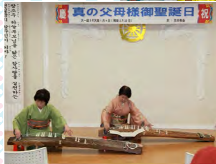
A blessed wife played koto at a commemorative service in Toyota Church in East Aichi parish (February 22nd)