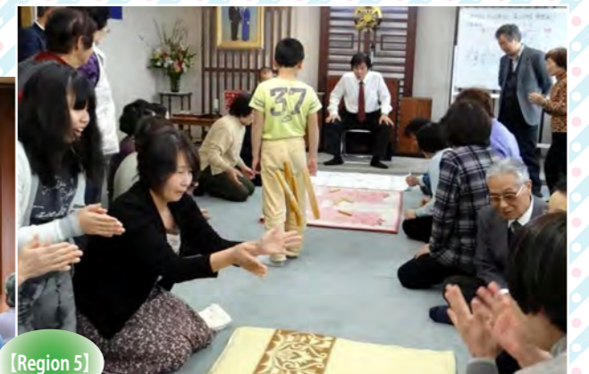
Taito Church held a yunnori game after the commemorative service