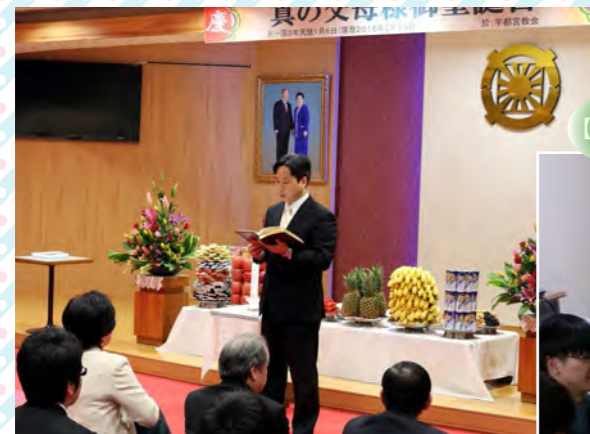
A commemorative service was held at Utsunomiya Church (Feb. 24th)