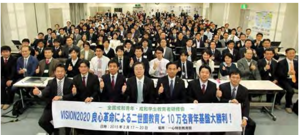
200 participated in National Workshop for Education Officials of Seonghwa Youth and Students

Unification Movement Japan: Under the slogan of VISION 2020 Second Generation Education through Revolution of Conscience and Great Victory over Foundation of 100,000 Youth!, the National Workshop for Education Officials of Seonghwa Youth and Students was held at the II-shin Education Center, Urayasu, Chiba, from February 17th to 20th.