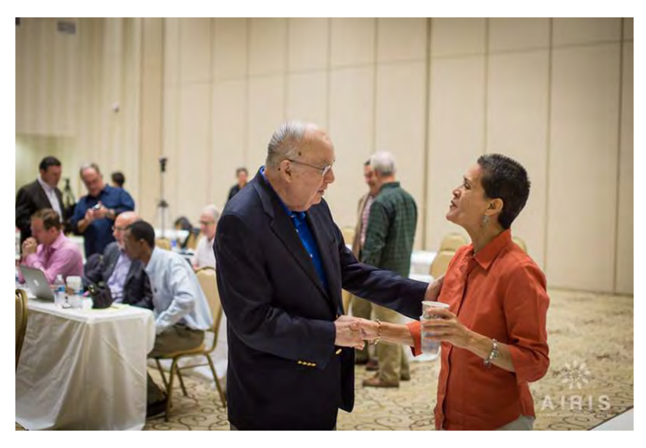
Nearly 50 Top Guns and spouses held a Top Gun Advance Conference over the weekend of November 6 to 8, 2015 at the International Peace Education Center in Las Vegas.

Top Gun alumni, members of the American Freedom Coalition (later called the American Family Coalition), together with current and former senior leaders of FFWPU-USA, have held several reunions over the past few years. The previous reunion spawned Origins Partnership, a 501c3 nonprofit organization dedicated to mentoring younger Unificationists and supporting projects that model and teach the revolutionary principles of True Parents and solve real world problems.