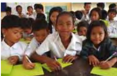
Students benefit from WFWP aid in Cambodia