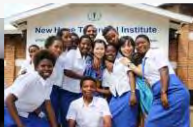
Young people receive job training at a WFWP school in Rwanda

WFWP works for sustainable peace, through our Leadership of the Heart education, through our Cornerstone for Happiness relationship education, and by providing aid to communities in need.