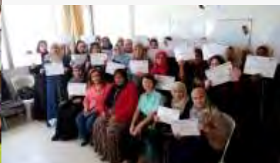
Refugee children benefit from WFWP aid in Jordan