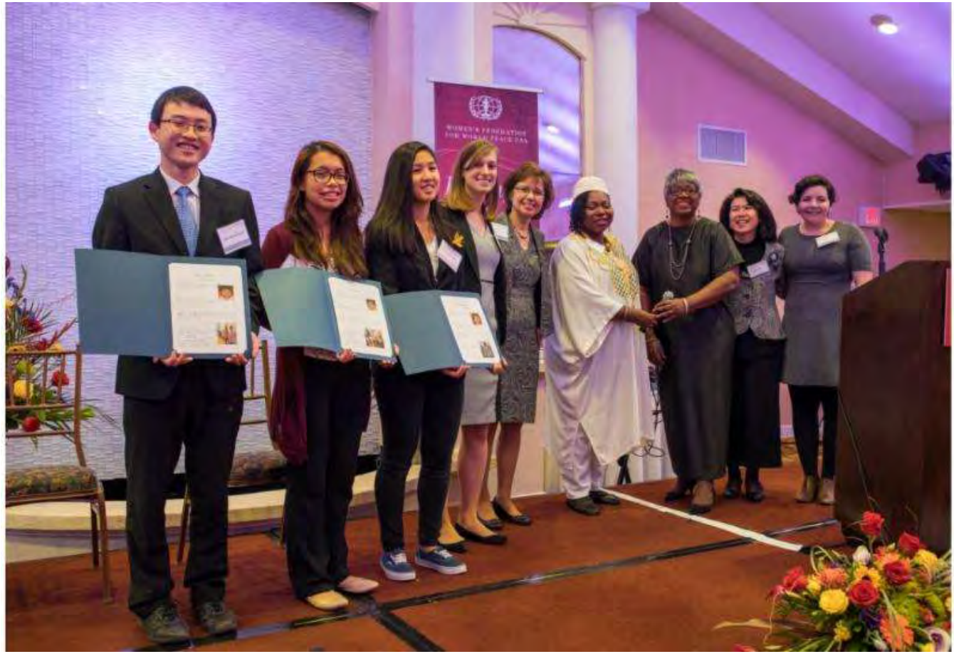
Click here to go to the website to read more...