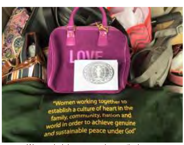
Women helping women in practical ways

We created a flyer with contact information and a Facebook event encouraging women to collect and/or donate bags filled with