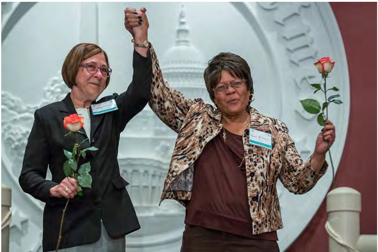
6. Interracial Couple – Creating World Peace through International and Interracial Marriages