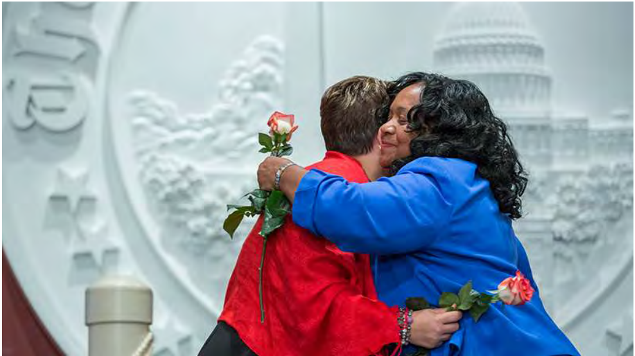
5. Black and White – To Build Black and White Unity