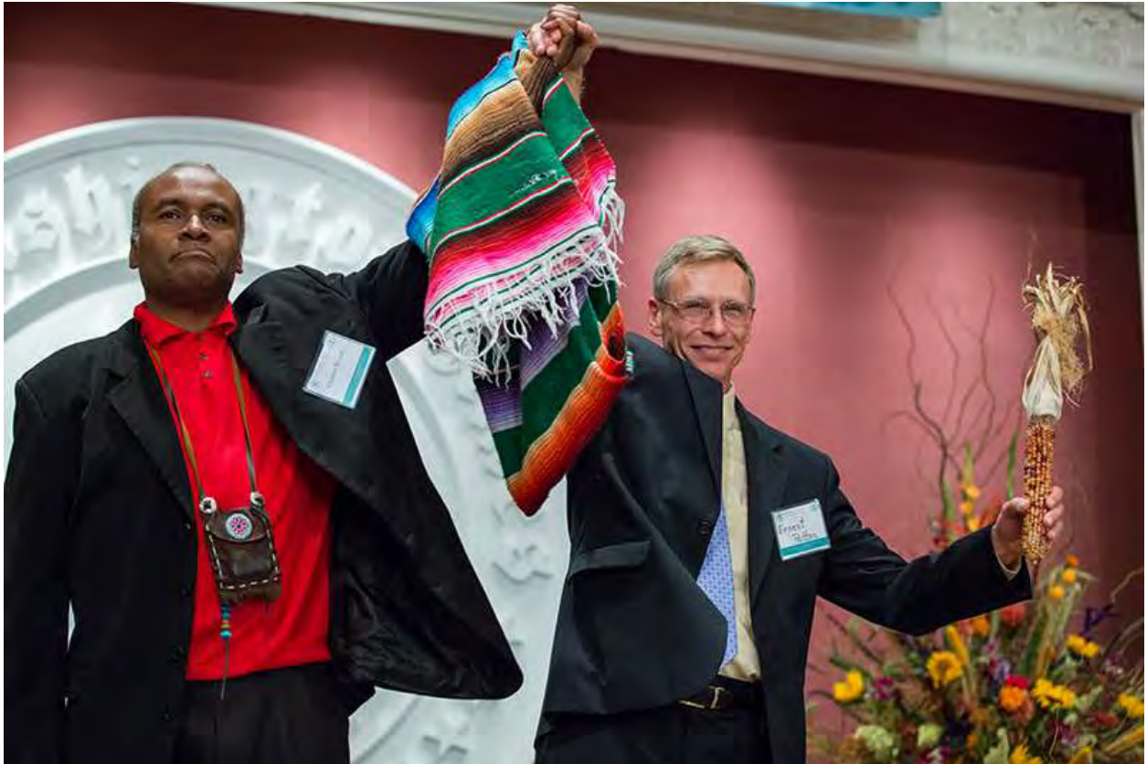
4. Democrat and Republican – Democratic and Republican Cooperation