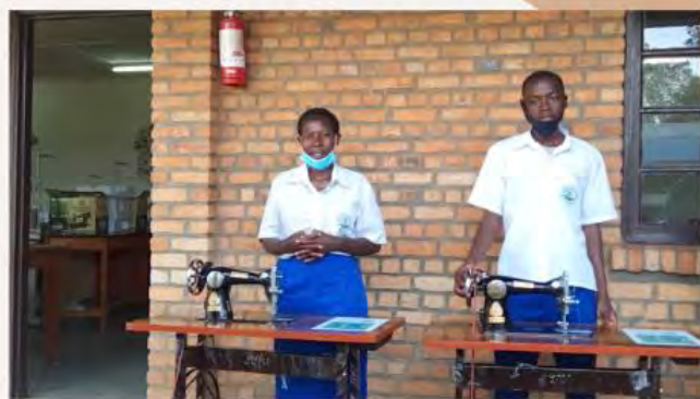
Message from student

A big Thank You to all who donated and created fundraisers in 2022 to raise money for our WFWP Schools of Africa Program. All donations received are transferred once a year to various schools based on the needs communicated to us. Admin costs are carried by WFWP USA. We will continue to update you as we receive reports and thank you messages from the different schools.