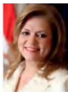
Hon. Mdm. Emilia Alfaro de Franco First Lady, Paraguay (2012-2015) Senator (2015-2018)