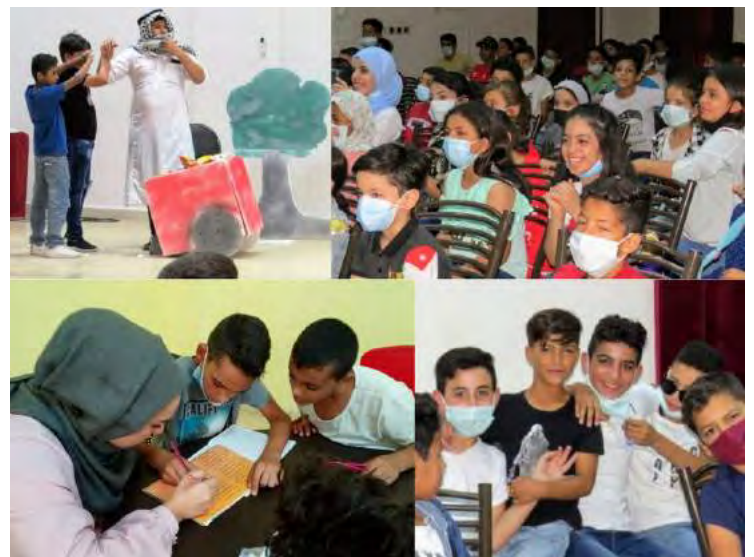
Providing a brighter future to refugee children in Jordan