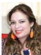
Hon. Mdm. Maria Fernanda Flores de Alemán First Lady, Nicaragua (1997-2002) Congresswoman (2012-2020)