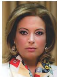
Speaker: Hon. Mdm. María Fernanda Flores de Alemán First Lady, Nicaragua (1997-2002) Congresswoman (2012-present)