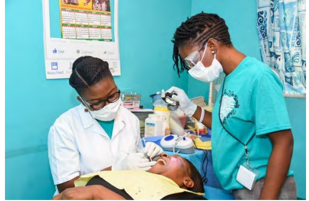
Haiti Medical Mission Trip promoting health and oral hygiene, combating chronic diseases, and providing gynecological care