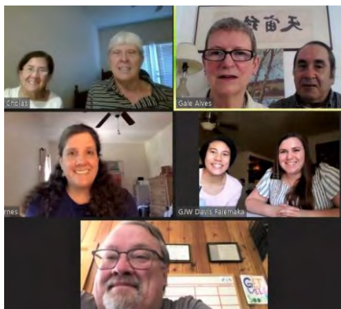
Interreligious Virtual Sharing Series in Colorado