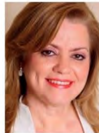
Speaker: Hon. Mdm. Emília Alfaro de Franco First Lady, Paraguay (2012-2013) Senator (2015-2018)