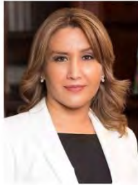
Speaker: Mdm. Hilda Patricia Marroquín de Morales First Lady, Guatemala (2016-2020)