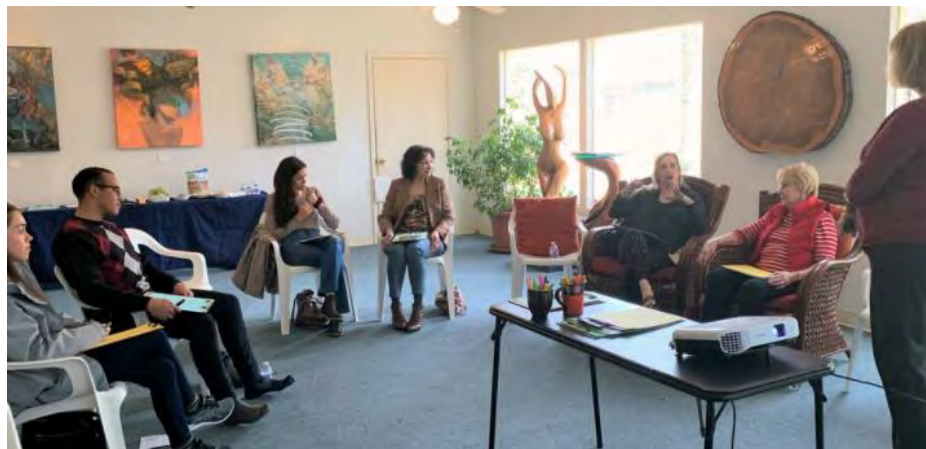
Heal Your Family, Heal the World presentation series in Georgia