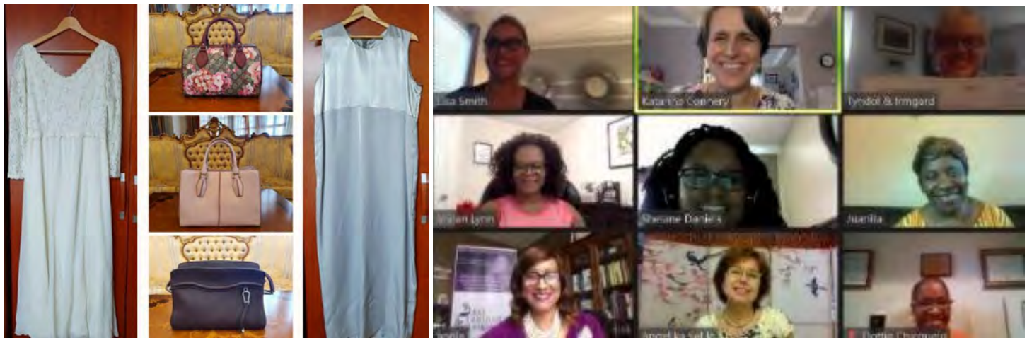
WFWP Founder Dr. Hak Ja Han Moon donated items at the launch of the Giving for Good campaign