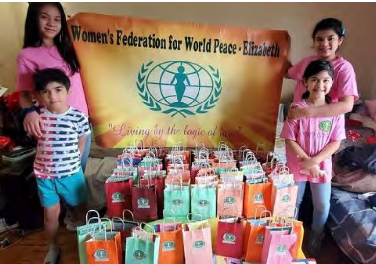
WFWP Girls send Bags of Love to frontline workers