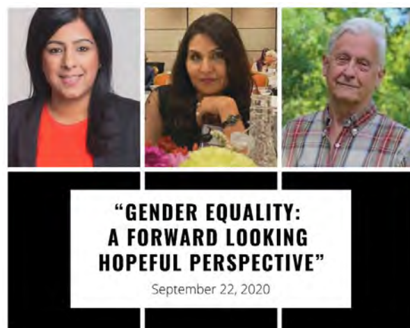
GWPW Canada virtual zoom webinars