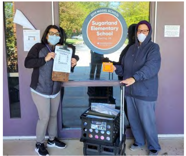
WFWP Northern Virginia Chapter donates art kits to local elementary schools