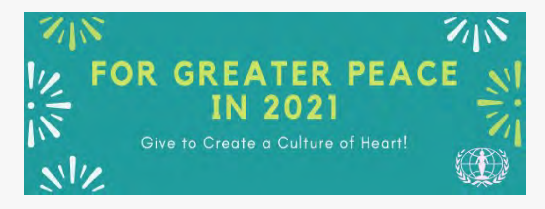
"The time has come for humanity to tune our ears to the sound of heaven."

Help women share their nurturing and resilient hearts with the world!