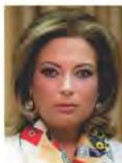
Speaker: Hon. Mdm. María Fernanda Flores de Alemán First Lady, Nicaragua (1997-2002) Congresswoman (2012-present)