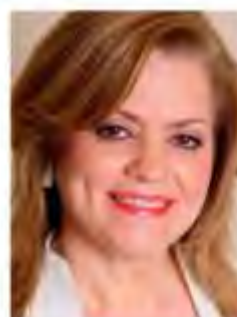
Speaker: Hon. Mdm. Emilia Alfaro de Franco First Lady, Paraguay (2012-2015) Senator (2015-2018)