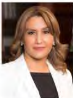
Speaker: Mdm. Hilda Patricia Marroquín de Morales First Lady, Guatemala (2016-2020)

"Women's Leadership in Times of Global Crisis"