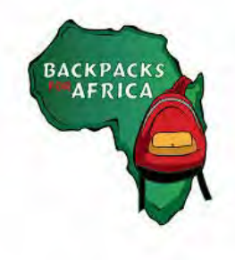
Backpacks for Africa