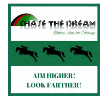
Chase the Dream Culture, Arts & Beauty