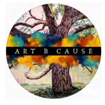
Art B Cause