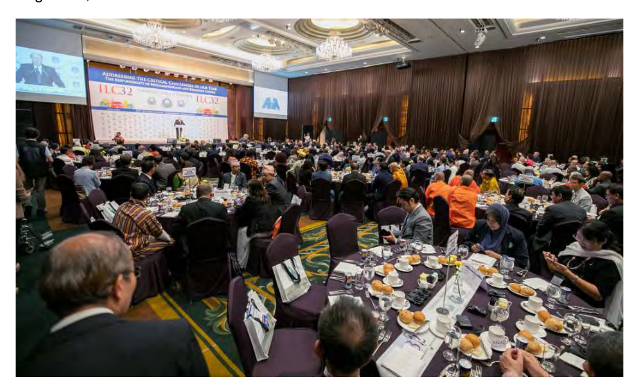
Seoul, Korea -- The 32nd International Leadership Conference organized by UPF brought together more than 300 leaders from over 80 nations.

The ILC was held at the Lotte Hotel World from August 26 to 29, 2018, under the theme "Addressing the Critical Challenges of Our Time: The Responsibility of Parliamentarians and Religious Leaders."