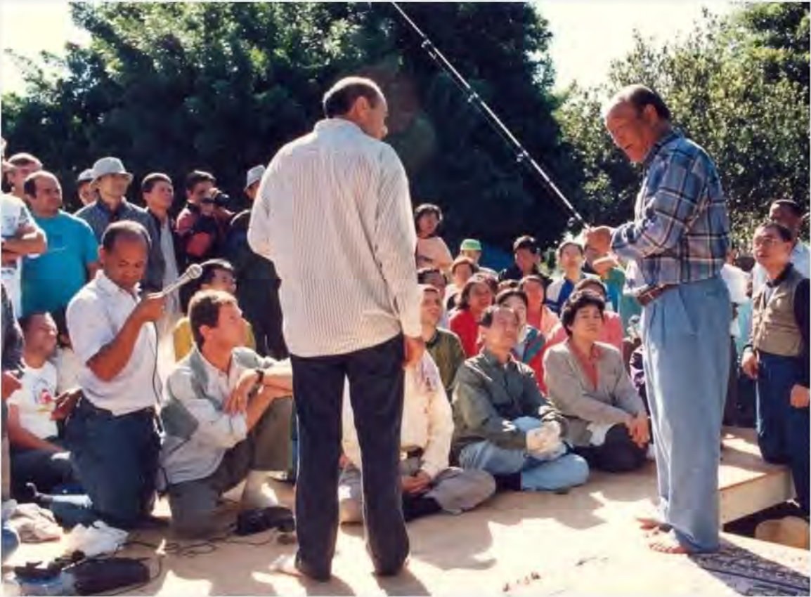
Rev. Sun Myung Moon teaching church members how to fish in Jardim, Brazil in the 1990s

These teachings align closely with the Brazilian bi-vocational model: faith integrated with practical service, enterprise, and community-building.