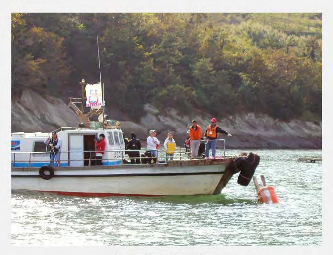
Peace King Cup held in Yeosu, Korea 2003.

Throughout the article, we will be exploring these three purposes of fishing tournaments as per True Father's words.