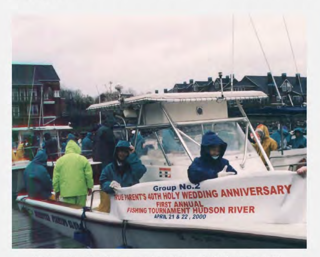
The first annual Striped Bass fishing tournament celebrating True Parents' Holy Wedding Anniversary in 2000.

The fishing tournaments clearly had a significant role in the Ocean Providence, and we must understand why it might be necessary to continue the tradition of tournaments. What was the purpose behind these events?