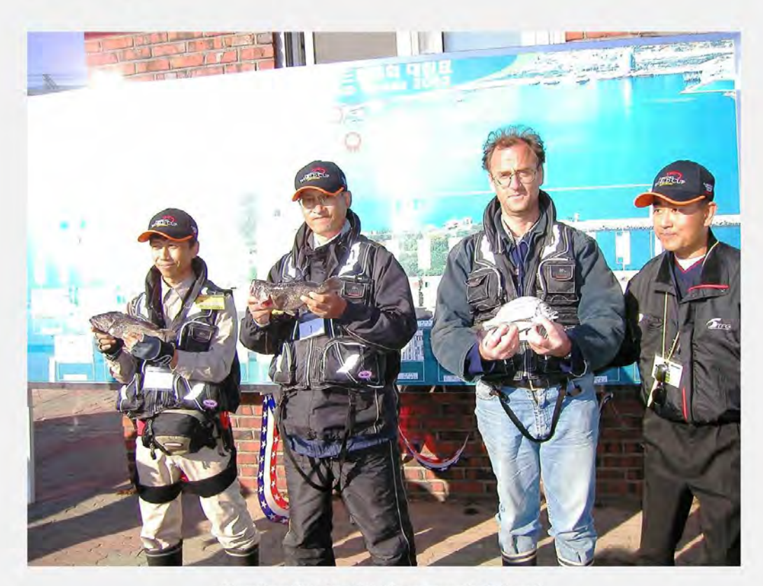
Yeosu Peace King Cup 2003 winners presenting their catch

Through these exciting, competition-style fishing events held around the world, True Father attracted people to spread and teach the necessary skills needed to become the leaders of the ocean era and to overcome hunger.