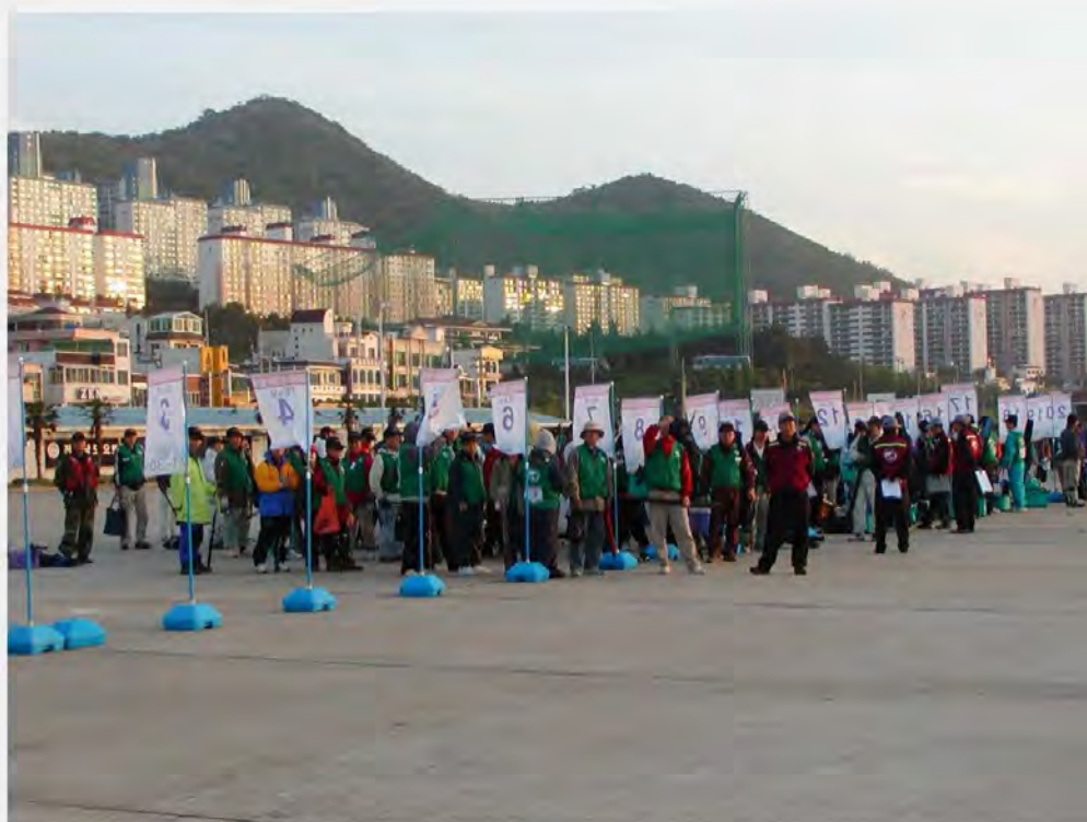
Yeosu World Peace King Cup Fishing Tournament 2004.

...Since you participants represent your own nations, this might create barriers of national pride during the tournament. However, you must unite. In fact, you need to build such a spirit of unity here that you will unite even more tightly after the competition is over. Before you came, you Japanese, Koreans and Americans were historically enemies to one another. Here, during this fishing tournament, you must break down such barriers." (CBG Book 10, Chapter 2, Section 5, Fishing Tournaments, 2001/08/18)