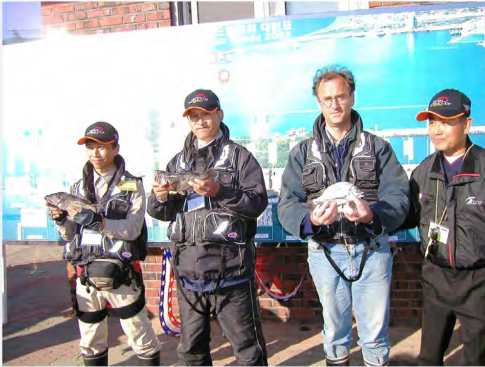
Yeosu Peace King Cup 2003 winners presenting their catch.