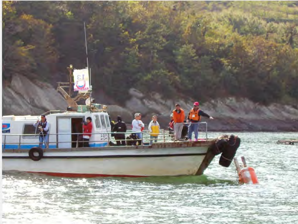
Peace King Cup held in Yeosu, Korea 2003.