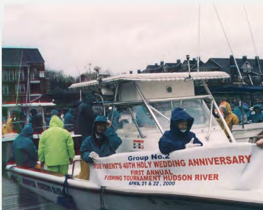
The first annual Striped Bass fishing tournament celebrating True Parents' Holy Wedding Anniversary in 2000.

The fishing tournaments clearly had a significant role in the Ocean Providence, and we must understand why it might be necessary to continue the tradition of tournaments. What was the purpose behind these events?