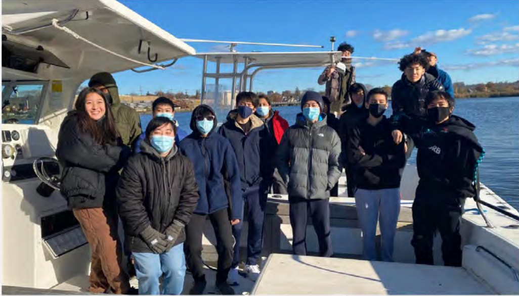
The youth of FFWPU gathered at the Little Ferry, New Jersey, to experience boat driving

In addition, the program also places importance in physical activities such as (1) preparing fishing rigs, (2) use of fishing rods, (3) sushi party, (4) boat driving experience, and (5) trivia quiz with awards.