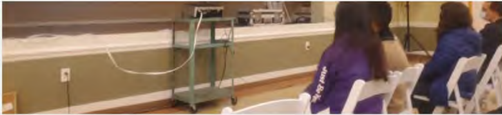
Youth educators at the Clifton Family Church in New Jersey view and discuss the materials of the youth program