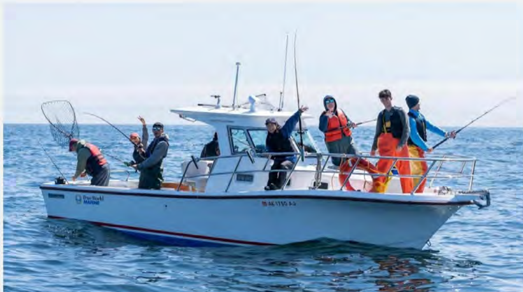
Photo from NOCP 2021; participants using a Good Go boat designed by Father

In recent years, the program has attracted youth from all over the world to experience the Ocean Challenge program.