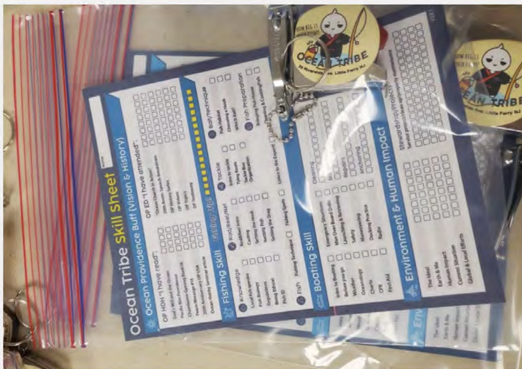
The skill sheet used to manage achievements of participants