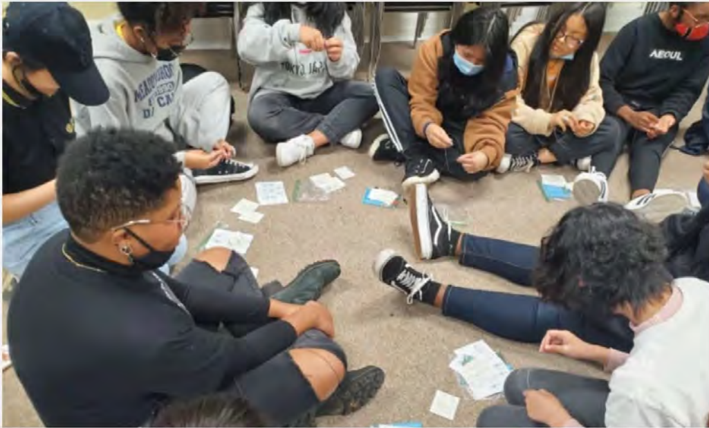
Youths participate in fishing rig preparation