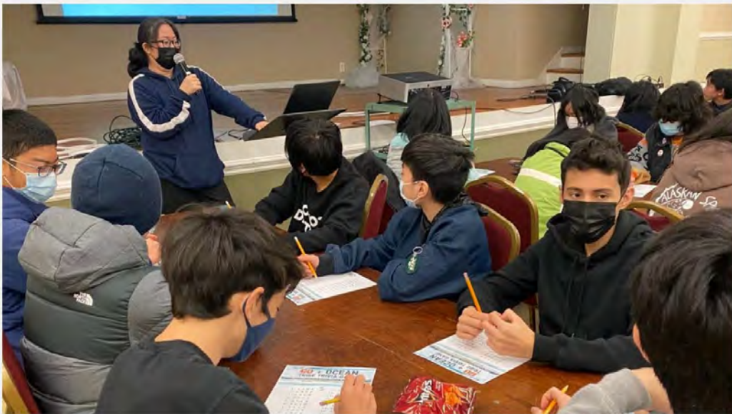
Youths participate in trivia quiz about Ocean Providence with awards