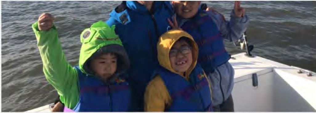
A family chartered one of the boats to go fishing in front of the Statue of Liberty