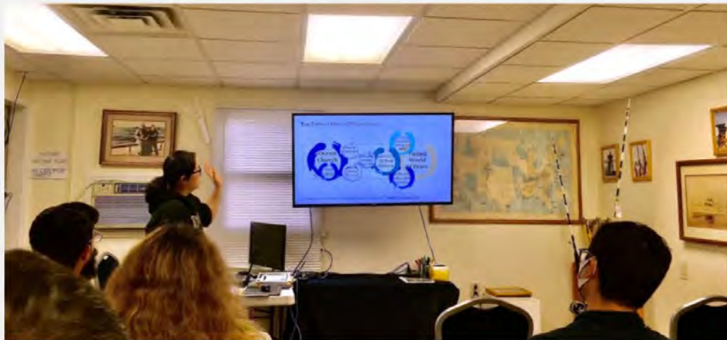
Photos and historical documents are displayed on the walls of Ocean Church