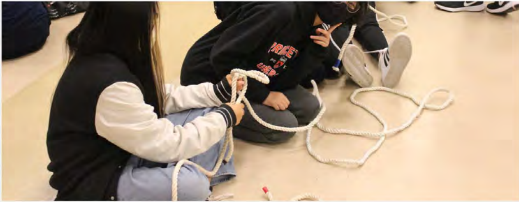
Youths participate in rope knot training