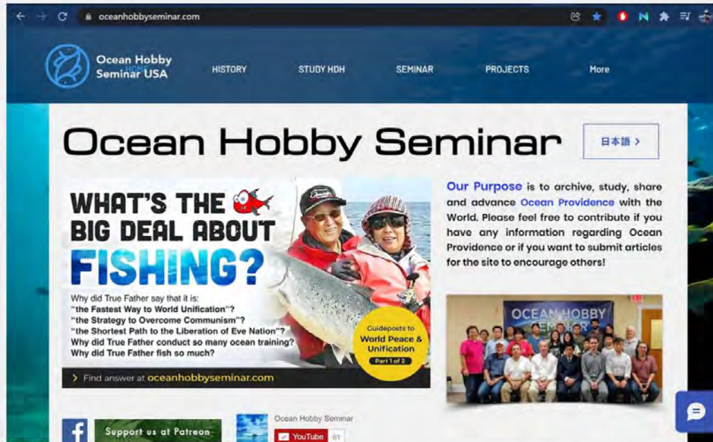
Ocean Hobby Seminar team operates a website focused on Ocean Providence

An online archive for Ocean Providence is being built so that anyone can learn the history of the Ocean Providence in different languages. Students of providence and educators can download various educational contents from this site.