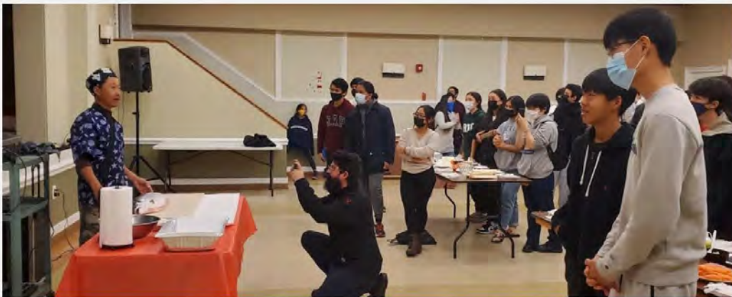
Youths participate in fish cutting demonstration in Clifton Family Church in New Jersey