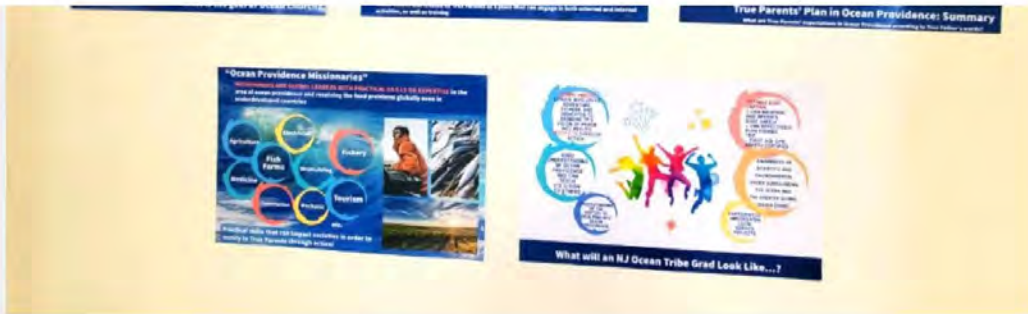
The posters on the wall show the vision and the goals of Ocean Church laid out by True Father