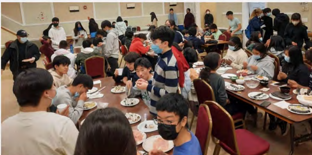
A sushi party at Clifton Family Church in New Jersey