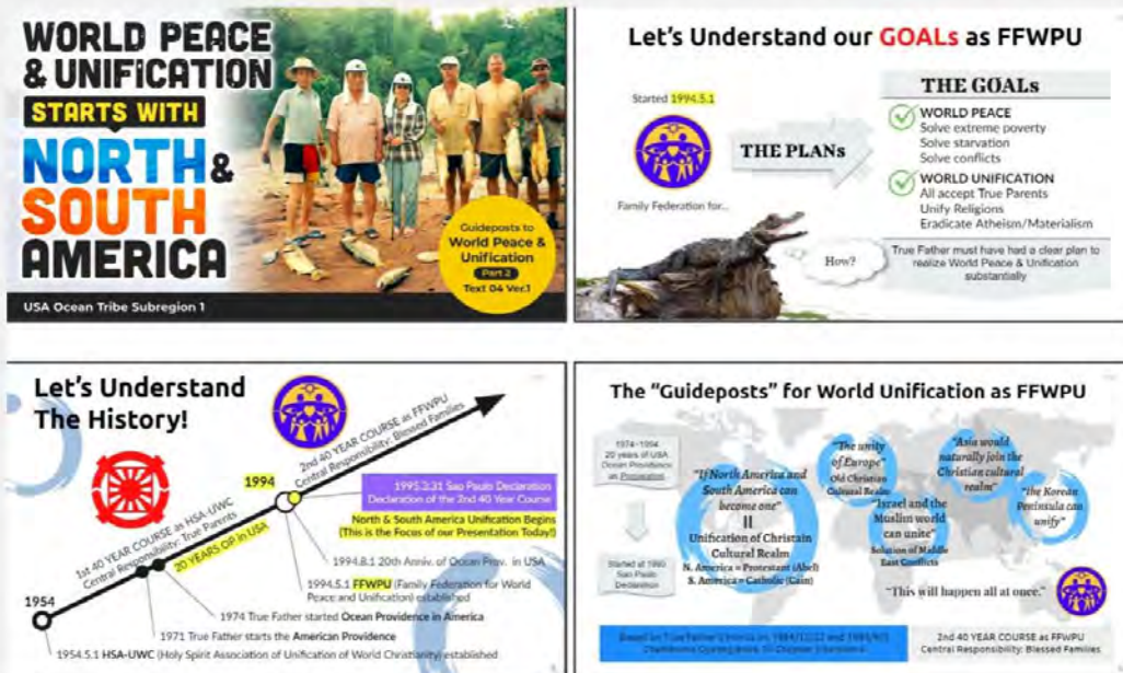
The images of the slides used for the Web Seminar

The schedule of the Web Seminar conducted every two weeks