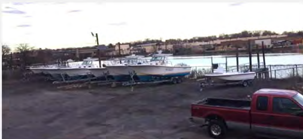
Ocean Church property in Little Ferry, New Jersey