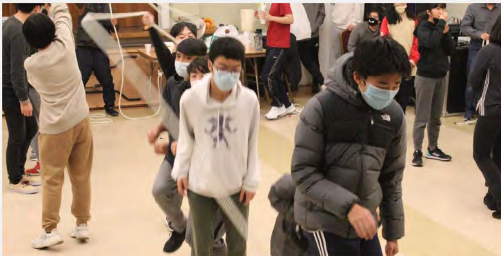
Participants during Game 1 - Jump rope