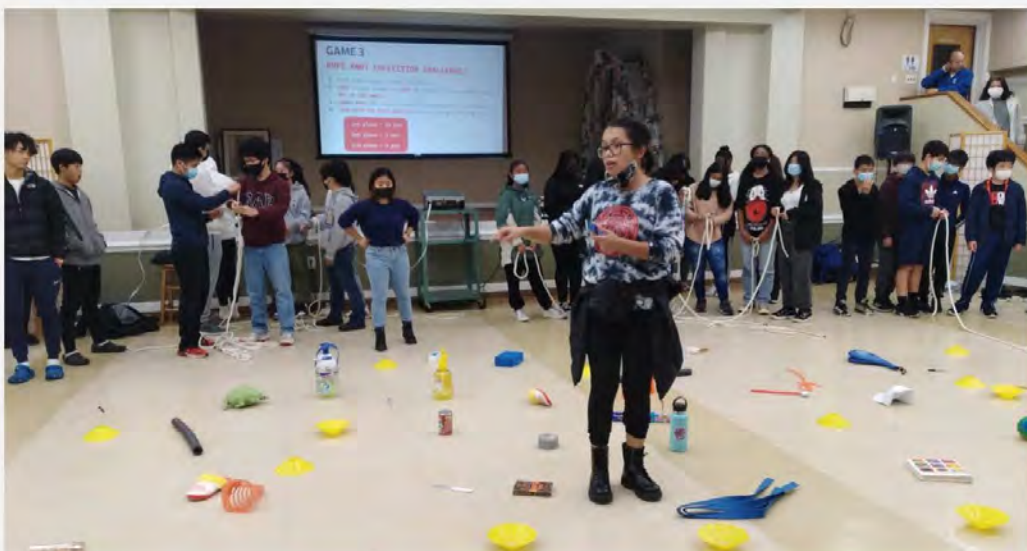
Participants during Game 3 - Rope Knot Collection