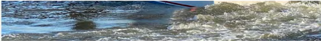
Participants departing on the boat