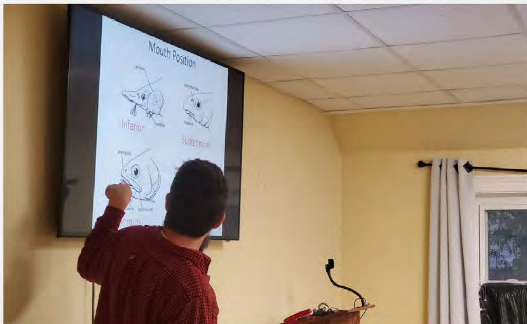
Explaining the different fish and hooks