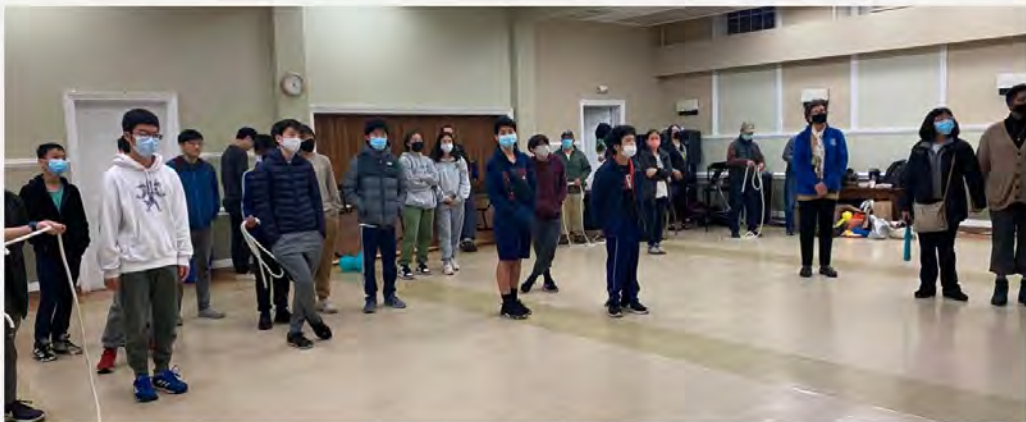
Participants listening to instructions for activities