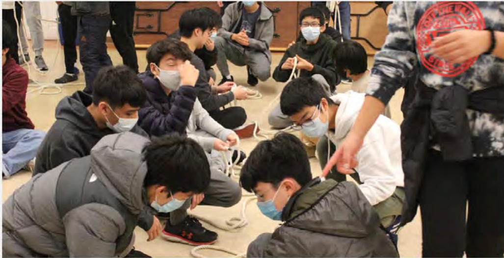
Participants learning to tie rope knots