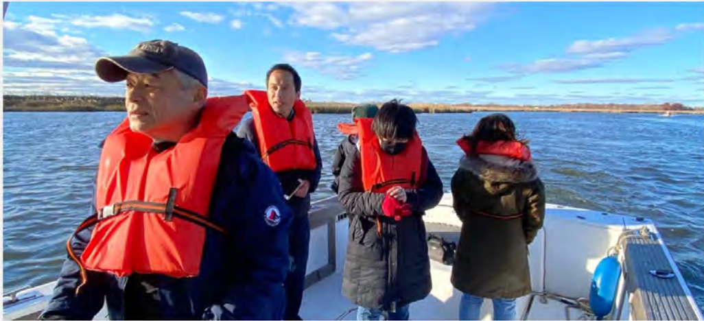
The participants and captain on the boat