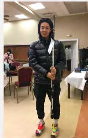
The winner of the trivia with Father's fishing rod