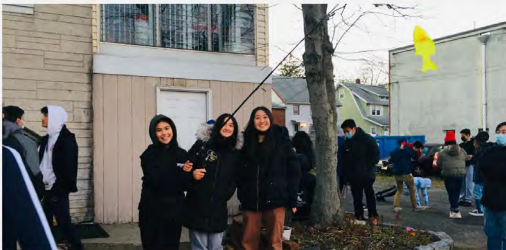
A participant showing off her "catch"