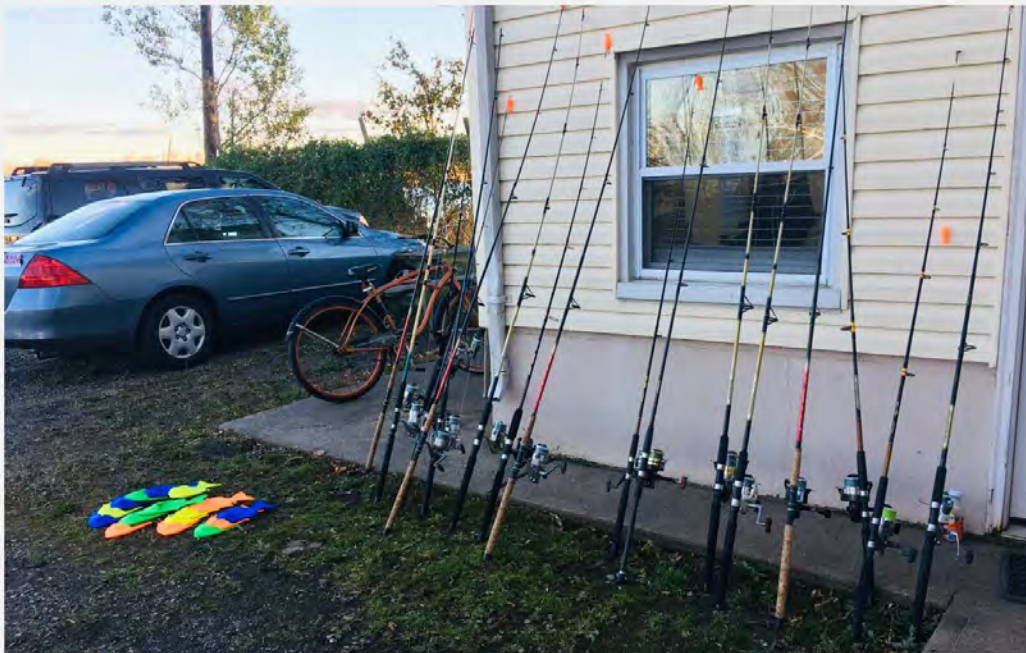
Fishing rods and fake fish prepared for the participants