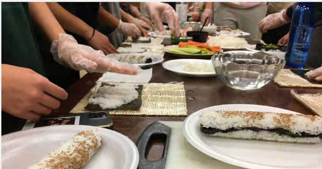
Participants making their own sushi rolls