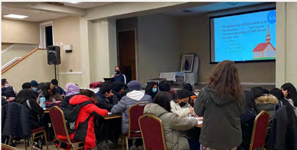
Participants listening intently to the trivia questions