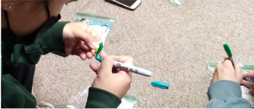
Participants customizing their own spoons