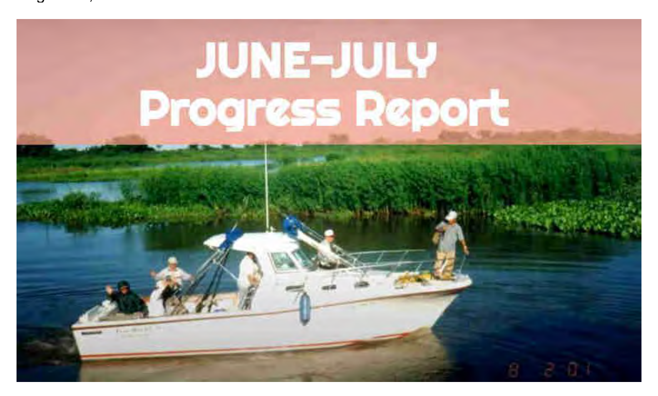
Nabileque Project, and our Road towards Ocean Hobby Industry Model Base