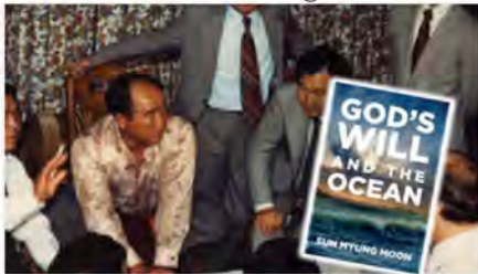
New Project: Translation of "God's Will and the...

Let us all go forward with no regrets! Let us do our part in offering the victory to God