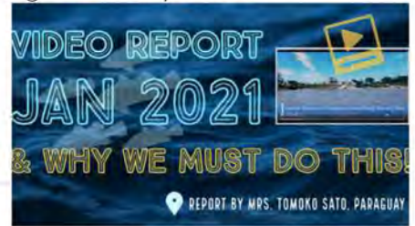
Video Report Jan2021 & why the boat is an...