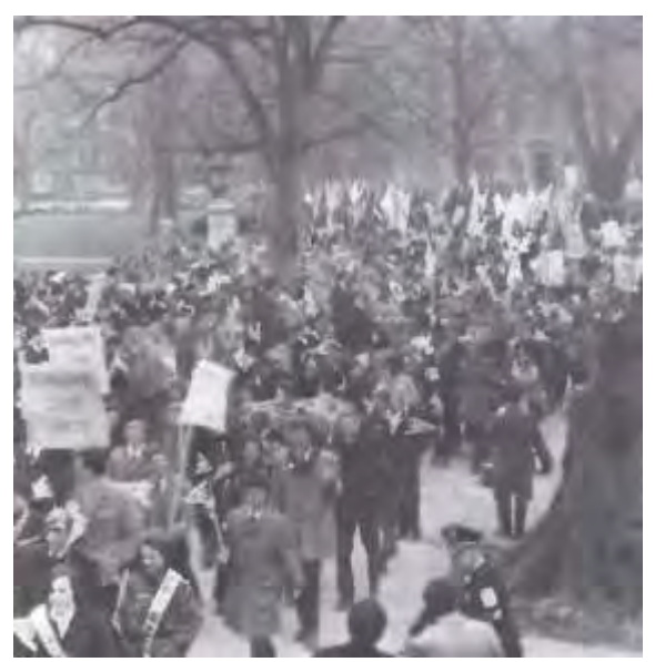
In rainy weather, NPFWC members gather for prayer across from the White House.