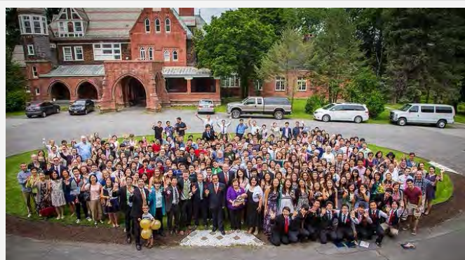
GPA 2015 Graduates at UTS in Barrytown, Upstate New York.