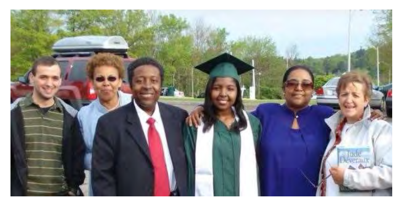
Question: What is your vision for the Albany chapter? Do you have a special focus or field of interest?

It is so easy to assume that it is simpler to work things out on your own, but through this journey I learned that it really does take a village. And no one should ever go about a goal alone. There needs to be some kind of a support network or at least a trinity to help you see the joy even through all of the madness, to help keep your spirit and heart aligned and to continue to focus on the big picture. One family under God. That is the goal. But it will take a village, so that energy can spread to cities, the country, and eventually the whole world.