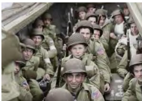
U.S. Soldiers before Normandy Landing on D-Day