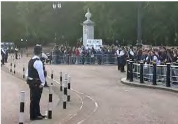
Trump Banner across from Palace Gates

We were both interviewed by so many media outlets it was incredible. They were all over us: CBS/SKY/ABC/German National Radio/French National Radio and others I can't remember. Only the BBC refused to interview us. A senior BBC journalist turned up with a camera man to see what was going on. When he saw all these people celebrating Trump and having their photo taken with the banner, he was shocked, shaken, and disgusted. He didn't know what to do. He called his superiors. He was almost shaking. He said he couldn't understand what was happening. I said 'You see things are not what you think they are.' If I had been sharper I should have challenged him to interview me.