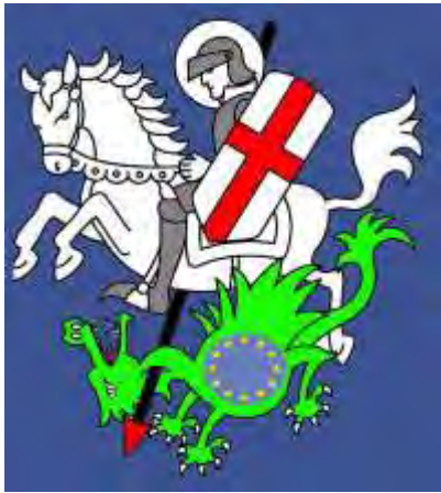
St. George Kills the (EU) Dragon

It was in fact totally a miracle and the working of Heavenly father.