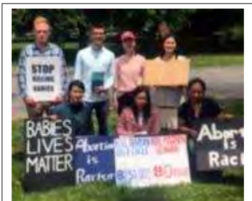
Sanctuary Pro-life Rally in Allentown

He spoke to the youth and young adults in the Sanctuary about the increasing responsibilities they will have as they grow older. He praised woodcutters who worked hard from 8am to 8pm on the Palace grounds. They have a great work ethic. Too bad society trains women to disrespect blue collar workers who work in dangerous and dirty jobs. They often look for rich, charismatic men, not honorable ones who may be more quiet and unassuming. Many men are waking up, not willing to take the disrespect any more.