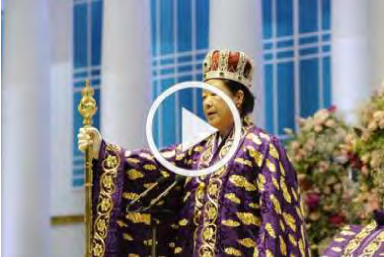
Hak Ja Han's deceptive events targeting Christians