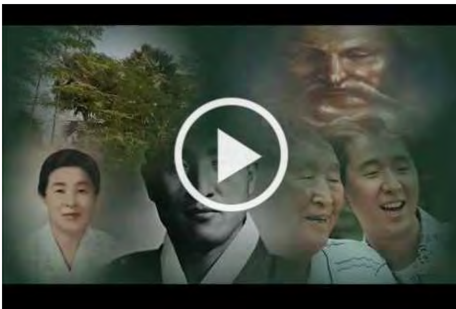
Han mother turns the children away from their Father