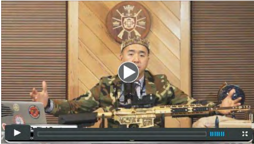
7/23/2018 We Tried to HELP (the Han) MOTHER Not to Turn True Children against Father!