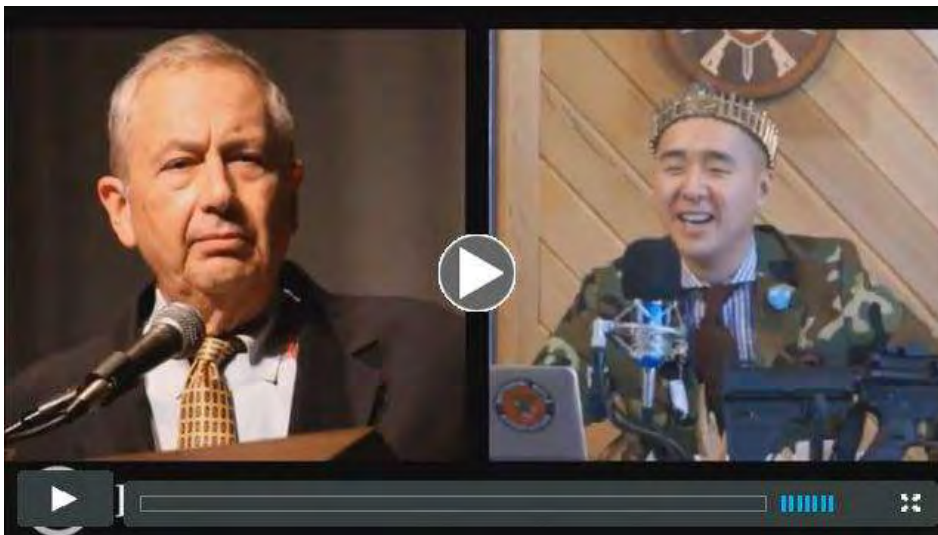
Sunday Service - June 3, 2018 - Unification Sanctuary, Newfoundland PA