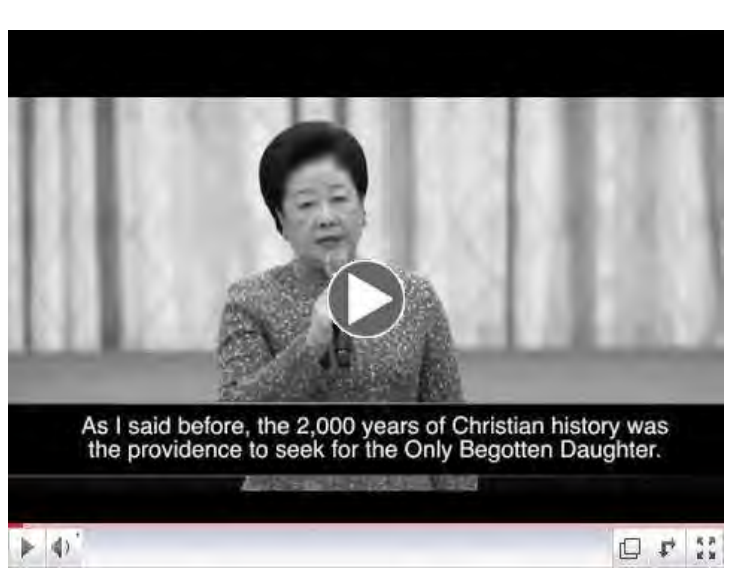
What is True Mother Currently Teaching?