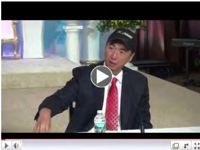
Are Jesus Christ and True Father the same spirit?