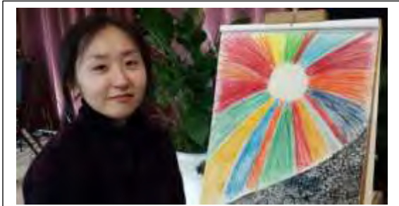
Praise Painting by Lee Eun Kwon based on 1 Timothy 1:1-2

If the government were your daddy, what kind of daddy would put a male student asserting a female identity in the girl's locker room, as was done by federal fiat during the last months of the Obama administration? The intent is to break down your will to fight evil. The goal is to break down natural marriage and families, to turn children against their "outdated" parents in order to make them wards of the state. Since public schools are an arm of the federal government, teachers are forced to teach agendas they don't believe in.