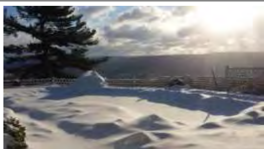
Winter at Cheon Il Goong Palace

World Peace and Unification Sanctuary - USA