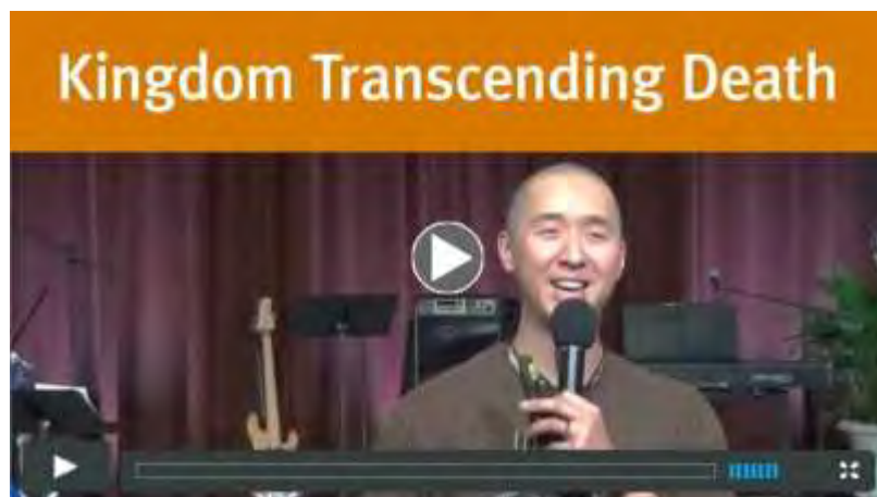
"Kingdom Transcending Death" Sanctuary Service - Feb. 12, 2017

Many of the Jewish religious leaders of the day feared doing anything to offend their Roman government occupiers. In this context, Jesus' powerful gospel of the kingdom caused anxiety among the Roman rulers and especially for the religious leaders who collaborated with them.