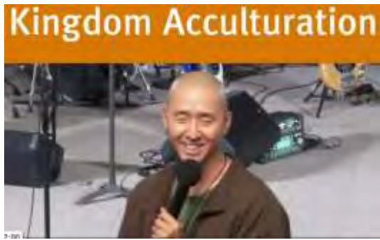
May 15, 2016 Sanctuary Sermon

A principled worldview is based on freedom, including pursuit of competition that must include acceptance of inequality or there is no real freedom, a free market, and strong families that invest in their children's development and success.