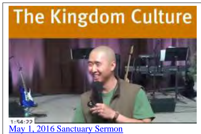
May 1, 2016 Sanctuary Sermon