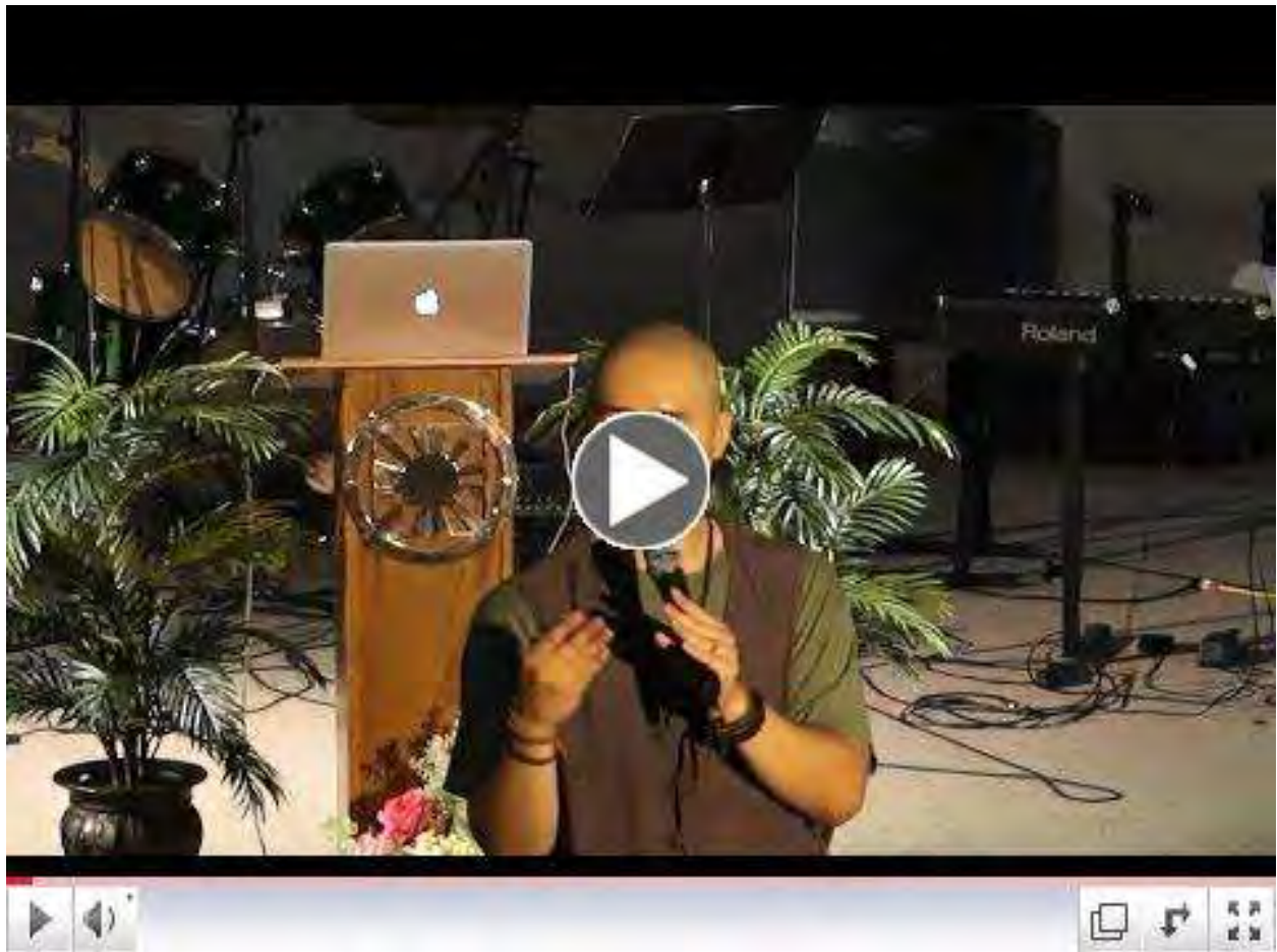
Deep Faith with God

Instead of desperately trying to "pull the weeds" of doubt, he explains, we should GO INTO those weeds with God . Instead of being "addicts" always seeking the "spiritual highs," we should seek a complete relationship with God, which also includes the low points where a fuller experience with God can be encountered.