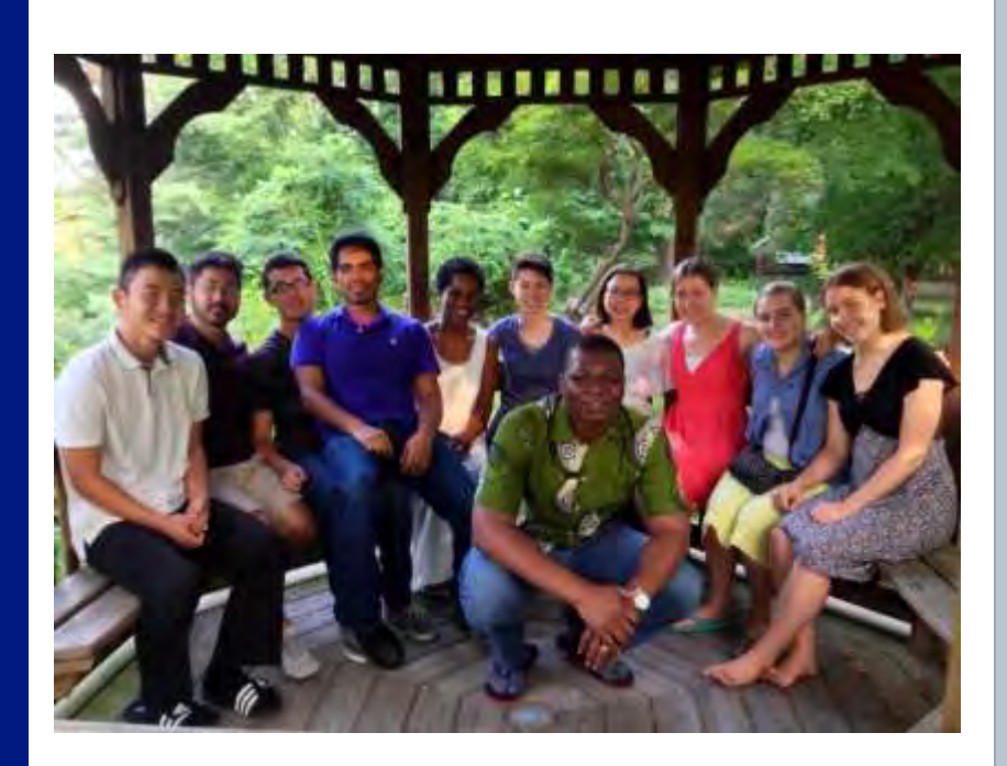
Morning Prayer Group at Barrytown College

Developing the undergraduate college in Barrytown has been one of the most inspiring projects I have ever worked on. I would like to thank the more than 1300 supporters for the courageous way they stood up to "Save Barrytown College and UTS."