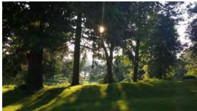
Barrytown Campus Facing Hudson River at Sunset

After even one class, I already feel that my perspective has broadened beyond just one community. I have universal tools to use wherever God calls me.