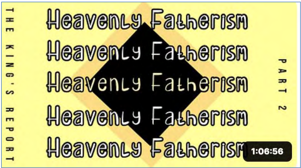
TKR- Heavenly Fatherism, Pt.2