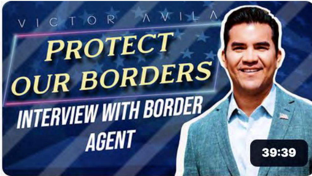
Border Agent: "Protect Our Borders"