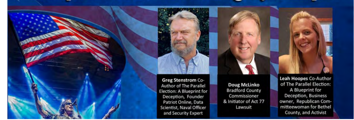
Election Integrity Awards Banquet - Pt 1 Video