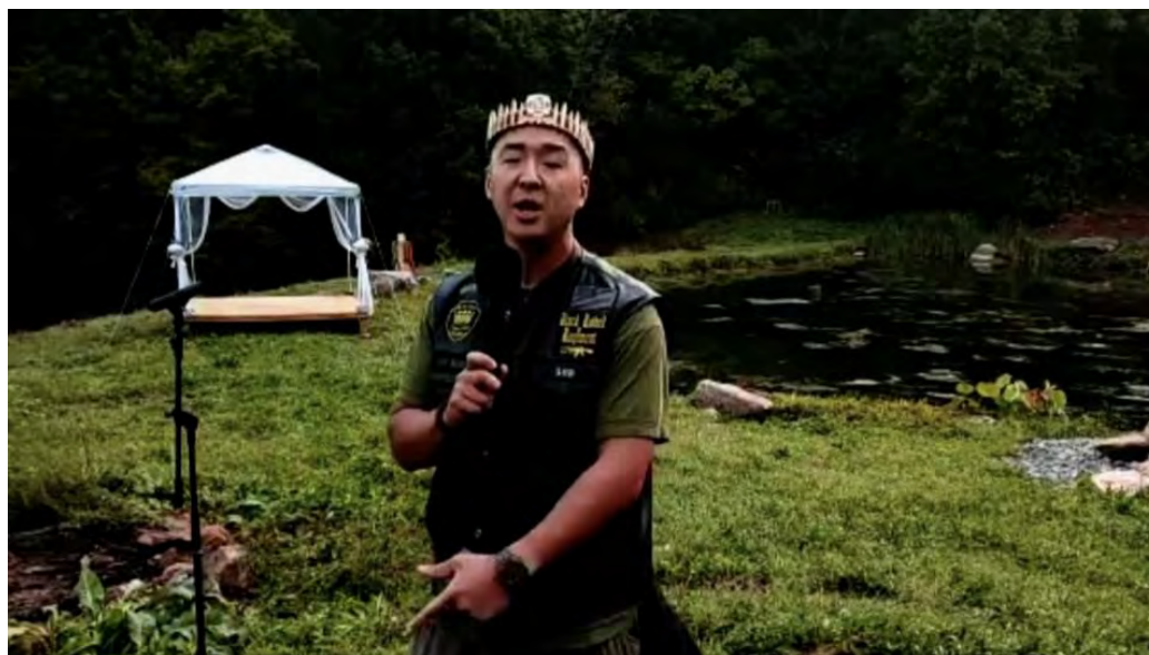
Hyung Jin Nim's Message from TN 9/19/2021

In certain parts of Australia you can't go more than 3 miles from your home because of Covid 19 fear and state-mandated lockdowns.