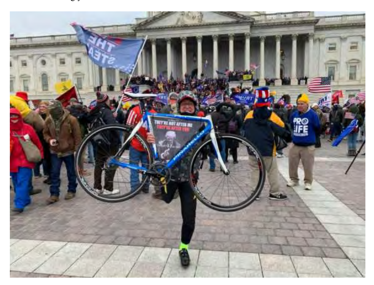
My Experience at the Trump Rally on the Ellipse and Capitol Hill, Jan. 6, 2021

Do you love God or do you love power? Are you ready to fight for something bigger than yourself? Even if it means risking your life?