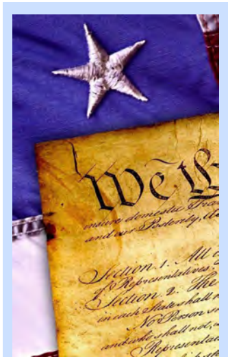
Rod of Iron Patriot Course