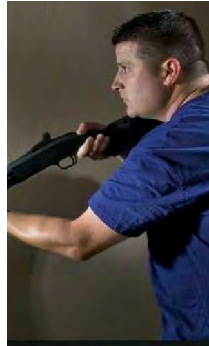
Home Defense Shotgun Program