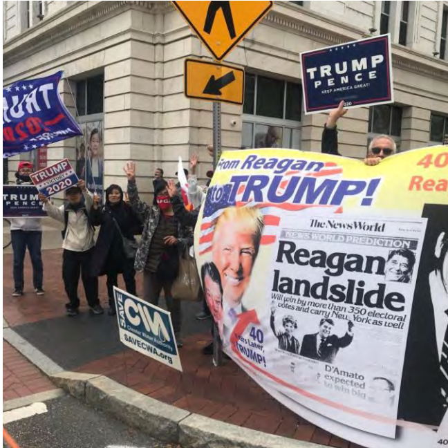
Trump Rally at State Capitol in Harrisburg

itself attracted me to want to be part of it, but what is Rod of Iron Ministries stand for?