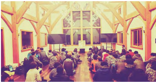
Early morning HDK at the True Parents' Memorial

SM: Well, the rod of Iron Ministries, it comes from the scriptures in the Bible that show a decentralized armed society as the Kingdom of God where the rulers or co-heirs with Christ are made into kings and priests as Revelation chapter 1 verse 5 states. And as the Bible says in Psalm chapter 2, we shall rule the nations with the Rod of Iron and dash them into pieces like the potter's vessel, but in the poimaino role, that is the shepherd's rule. Not obeying men's law like these crazy Chi-comm lockdown laws that we are protesting, but God's laws, serving God, guns and country.